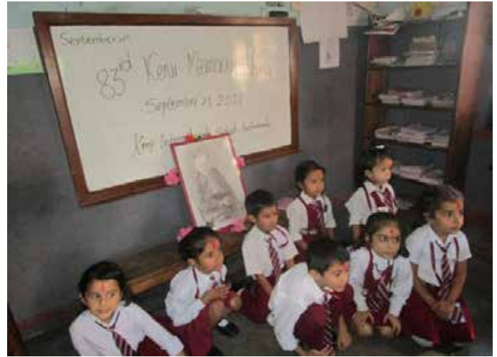
Image 9: Students of Kenji International School celebrating the anniversary of Miyazawa Kenji's birth