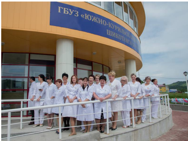
New hospital on Shikotan

because of the profile of the politician (she is health minister), but rather because she did not travel to Kunashir/i or Iturup/Etorofu like the others but instead visited Shikotan. It is also notable that the purpose of her visit was to open a new hospital. This is just one of a series of recently completed infrastructure projects on the islands and a further 70 billion roubles has been allocated for 2016-2025. The central authorities have also just unveiled a policy under which unused land in the Far East will be distributed to Russian citizens. The aim is to encourage economic development and the scheme will apply to the disputed islands. Lastly, in July 2015 Russia's Minister for Far Eastern Development announced plans to increase the number of people living on all of the inhabited Kuril Islands to as high as 24,000 [Kuz'min, 2015]. Evidently, the fact that all of these new schemes extend, not only to Kunashir/i and Iturup/Etorofu, but also to Shikotan does not give encouragement to the idea that Russia is willing to uphold its 1956 commitment.