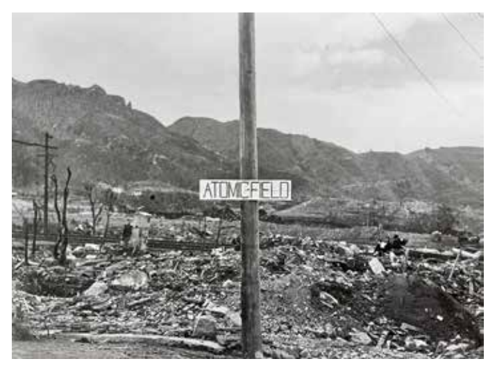
Figure 10. Atomic-Field

O'Donnell's narrative reaches a crescendo in the final chapter, assaulting the viewer with an unrelenting sequence of images of irradiated wasteland. The U.S. dropped the second atomic bomb on Nagasaki on 9 August 1945, killing between 40,000 and 70,000 people. In O'Donnell's photos, aerial views reveal the extent of the damage, while photos that he took on the ground place the viewer smack in the middle of the destruction. A few pages into the chapter, the viewer sees the landscape of Nagasaki up close (figure 10). One photograph focuses on a sign emblazoned with the words "ATOMIC-FIELD" posted amidst a landscape of shattered roof tiles, scorched wood, and crumbling concrete. Three Japanese civilians stand in the background on the right, almost lost among the sprawling detritus. They