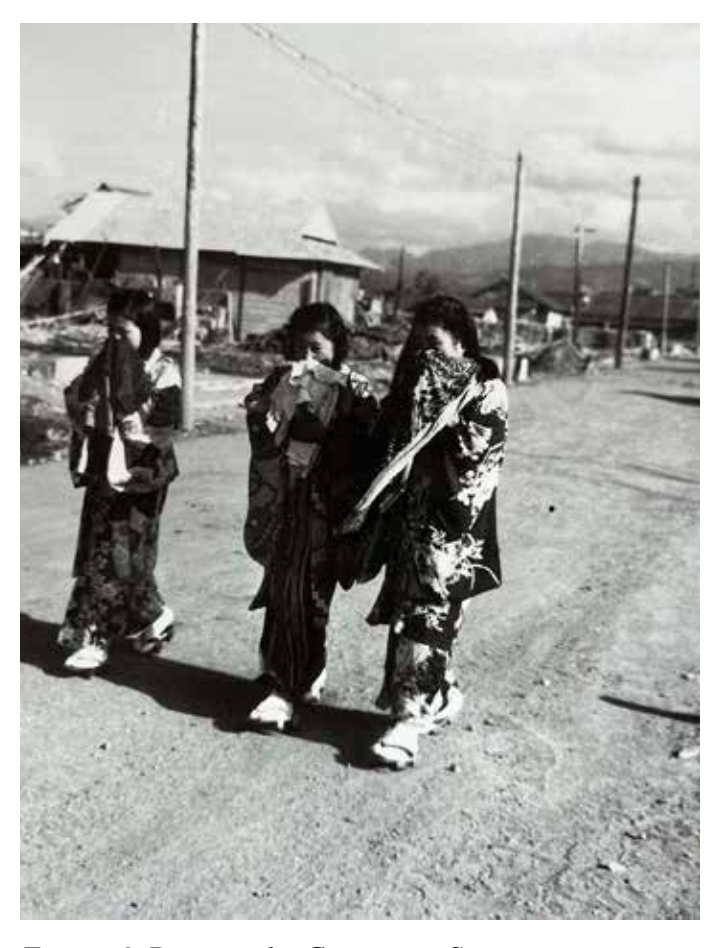
Figure 6. Passing the Cremation Site

diagonal lines of the road and slanting shadows. Together with the slight tilt to the frame, this puts the viewer off balance. The three girls themselves create tension as well; their elegant kimono with rich floral patterns contrast with the dismal surroundings. In this photograph, O'Donnell skillfully combines form and content to convey the death and destruction that pervaded Japanese society in the early postwar.