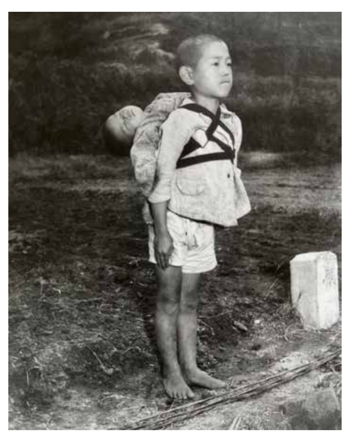
Figure 11. Cremation Site

O'Donnell only reluctantly turned his camera on those with severe physical wounds. In one photo that conveys in no uncertain terms the unimaginable physical suffering that he witnessed, O'Donnell captured a close-up of a boy's back, his burned flesh filled with maggots and oozing sores. In the caption, O'Donnell remembered the sickening smell as he helped to clear the maggots from the wounds. Horrified at the scene, O'Donnell vowed to never again photograph burn victims unless he received orders to do so. Even so, death and human suffering dominate the chapter on Nagasaki. One particularly heart-wrenching photograph shows a young boy standing at attention, his younger sibling strapped to his back (figure 11). At first glance, it appears that the toddler is merely sleeping. O'Donnell thought just this when he first spotted the pair, believing that the babe was snuggled safely on the back of his older brother. Soon, however, O'Donnell discovered the truth: