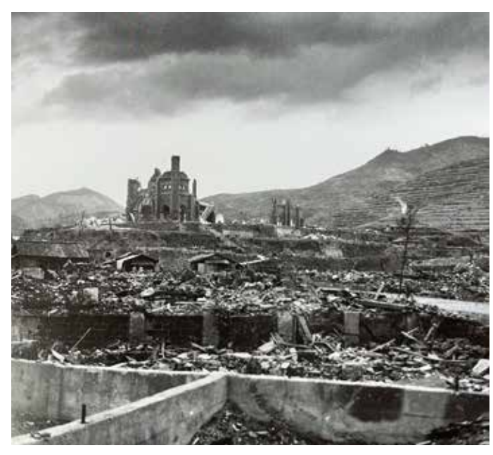
Figure 13. 'Calvary' in Nagasaki

The chapter ends with a series of photographs of churches, bringing the reader full circle to the religious imagery that opened the book. However, these dark, haunting photographs are the antithesis of the American priest in his white robes surrounded by U.S. Marines that opened the book (figure 4). One photo of the Urakami Cathedral shows the church sitting on a hill in the background, an expanse of debris extending between the viewer and the church (figure 13). Ominous clouds push down on the cathedral from above, casting it and the surrounding landscape in somber shadows. Two Japanese citizens stand under the eaves of a shack in the middle of the frame, their forms nearly invisible in the ravaged landscape. Religious imagery saturates the first and last photographs in the book. But whereas the first few photographs are filled with light—perhaps indicative of the belief in the just cause of the Occupation to reform a wartime enemy—the final photographs are so dark that they verge on the apocalyptic,