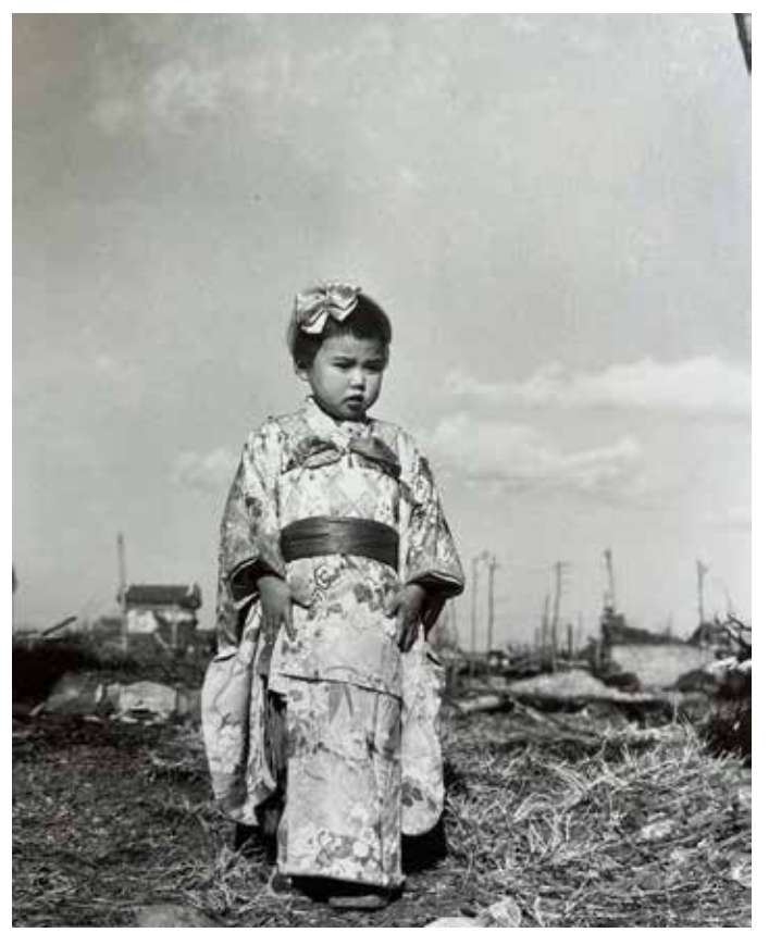
Figure 12. Dressed Up Little Girl

The chapter ends with a series of photographs of churches, bringing the reader full circle to the religious imagery that opened the book. However, these dark, haunting photographs are the antithesis of the American priest in his white robes surrounded by U.S. Marines that opened the book (figure 4). One photo of the Urakami Cathedral shows the church sitting on a hill in the background, an expanse of debris extending between the viewer and the church (figure 13). Ominous clouds push down on the cathedral from above, casting it and the surrounding landscape in somber shadows. Two Japanese citizens stand under the eaves of a shack in the middle of the frame, their forms nearly invisible in the ravaged landscape. Religious imagery saturates the first and last photographs in the book. But whereas the first few photographs are filled with light—perhaps indicative of the belief in the just cause of the Occupation to reform a wartime enemy—the final photographs are so dark that they verge on the apocalyptic,