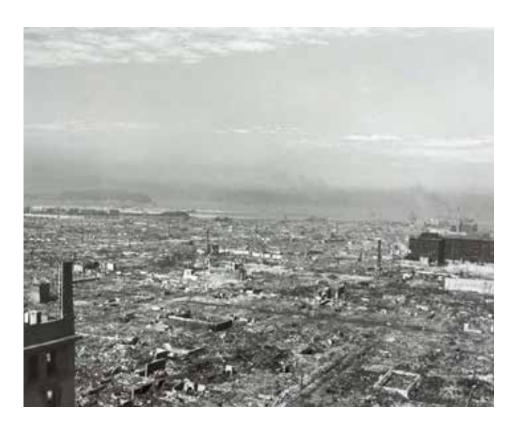
Figure 4c. Sasebo, Aerial View

trees. Families search for new places to live, carrying the few belongings they still owned. Women lug baskets full of rations, flanked by leveled buildings and blackened trees. Children swarm around a Marine sitting on the hood of his jeep, handing out chocolate and chewing gum to the hungry youth with outstretched hands. Quotidian moments punctuate these more somber scenes: young Japanese women hired as maids pose outside the Marine barracks in Sasebo, and a farmer harvests rice in a sunny field (figure 5).