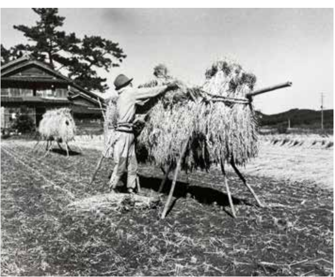
Figure 5. Rice Harvest

spected him as one of the dead. The spatial grounds 11 The Doolittle Raid was the first air raid against Japan on 18 April 1942. Due to a picket boat line set up several hundred miles east of Japan by Admiral Yamamoto, the sixteen B-25 bombers had to launch over 650 miles from Japan. Because of the long distance they had to travel, the pilots were forced to strike Tokyo in the daylight and land in China. Although damage in Tokyo was minimal, the raid had a tremendous psychological impact on Japan (Spector 1985: 154-155).