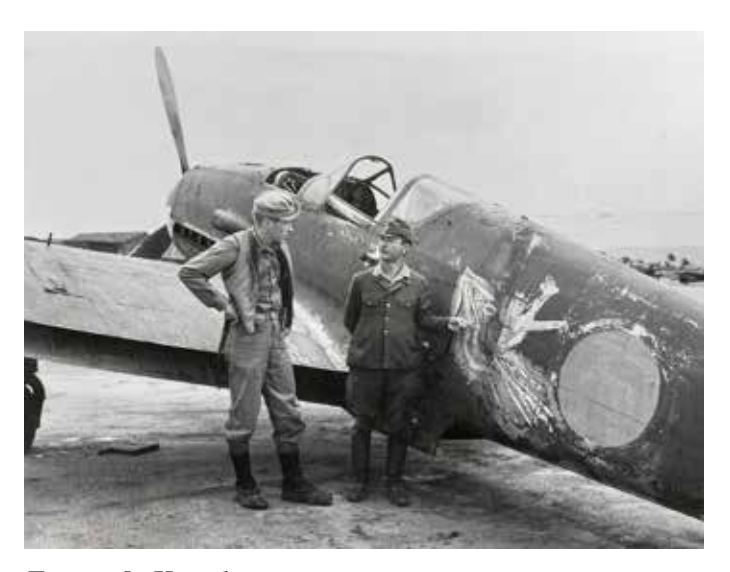
Figure 9. Kamikaze

In contrast to the mainstream American media, O'Donnell's photographs in Japan 1945 lacked any hint of lingering wartime animosities or portrayals of Japanese as hostile or mentally ill. In one photo, O'Donnell himself converses with a former kamikaze pilot instructor whose nineteen-year-old brother died in a suicide mission only days before Japan's surrender (figure 9). O'Donnell and the pilot appear at ease talking with one another. They stand next to the instructor's plane, which bears the image of a Japanese airplane attacking an American warship. One of the most intimate instances of cross-cultural exchange O'Donnell captured featured only inanimate objects: scuffed and muddy shoes lined up neatly in the genkan (entryway, where shoes are removed) of a local church. Rugged military boots have been placed side-by-side with Japanese-style shoes and geta sandals. "In a house of worship,"