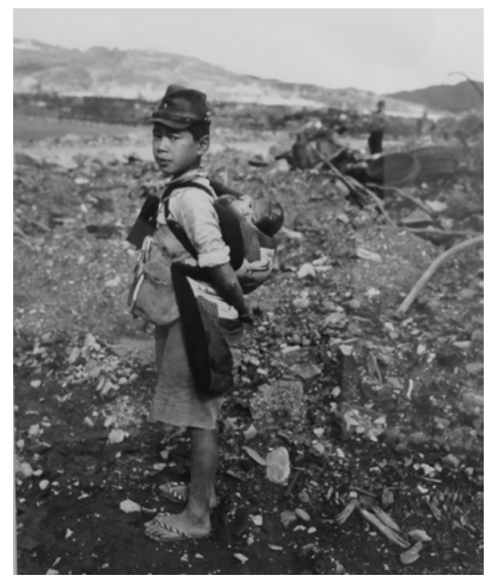
Figure 2. Body standing with baby brother among bombed ruins

The boy's upright posture and solid stance create a strong visual force that anchors the eye. He is slight and disheveled, surrounded by chaos, yet stands erect in a manner that allows him to rise above the ruins radiating around him.