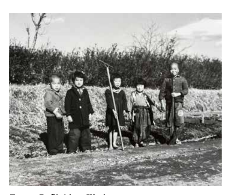
Figure 7. Children Working