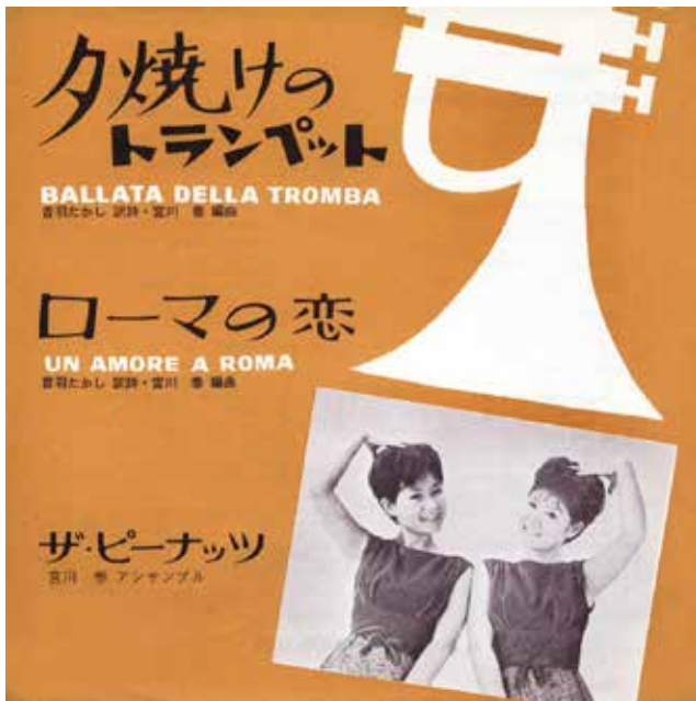
Fig. 1: Jacket covers of various 45 rpm singles released by The Peanuts

The Peanuts’ ties to Western Europe went beyond simple cover songs and linguistic citations. The duo frequently visited Europe to perform concerts, appear on television, and to undertake recording sessions. 14 They formed collaborative relations with a number of European musicians, most notably the Italian-French singer Caterina Valente. 15 The Peanuts released recordings on the continental market and apparently reached a fair degree of popularity, especially in West Germany and Italy, where they performed live and starred in television specials. They aimed their 1965 recording “Heut’ Abend” (released under the moniker Die Peanuts) at the West German market, mixing Japanese and German lyrics in a playful manner that embodied the fluid cosmopolitanism of their image. A 1965 Japanese magazine article reported that Watanabe Productions intended the duo to become global stars like film actor Mifune