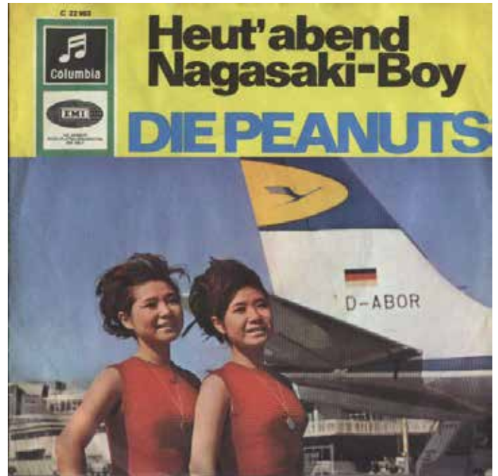
Fig. 2, 45 rpm single jacket for Die Peanuts, “Heut’ Abend” (Columbia Records Germany, 1965)

Toshirō and described their domestic fans as feeling a bit like Spencer Tracy in Father of the Bride , watching their little girls grow up and leave home. 16