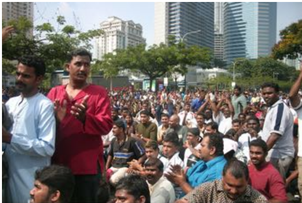
HINDRAF demonstration, Kuala Lumpur, 2007

The organizers of Bersih -- Gabungan Pilihanraya Bersih dan Adil / Coalition for Clean and Fair Elections -- engage with one aspect of the abuses, while the HINDRAF organisers more specifically target the ethnocratic structures under which the non-Malay communities they have been discriminated against.