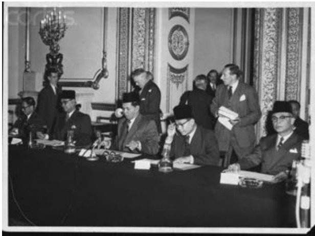
Constitutional discussions between Britain and Federation of Malaya, London, 1956

A London conference with Secretary of State for the Colonies Alan Lennox-Boyd to discuss eventual independence was then held in January 1956. As a result of the discussions, the British government agreed to grant Malaya independence on 31 August 1957.