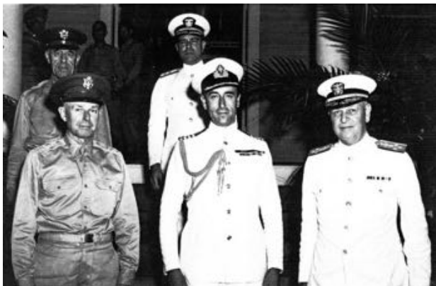
Louis Mountbatten (centre), 1941.

However, into these smooth Colonial Office preparations for a Malay-dominated post-war Union in Malaya stepped a problem. Lord Louis Mountbatten, Supreme Commander of Allied Forces in the South East Asia, based in Ceylon, began to engage himself in post-war planning. In terms of overall political power, he expressed opposition to the reinstatement of the Sultans: “I am not in favour of reinstating the Sultans even as constitutional rulers and certainly not as autocratic rulers...But we must be careful not to abolish the Sultans ruthlessly.” [14] He urged some sort of Upper House position for them in a future legislature.