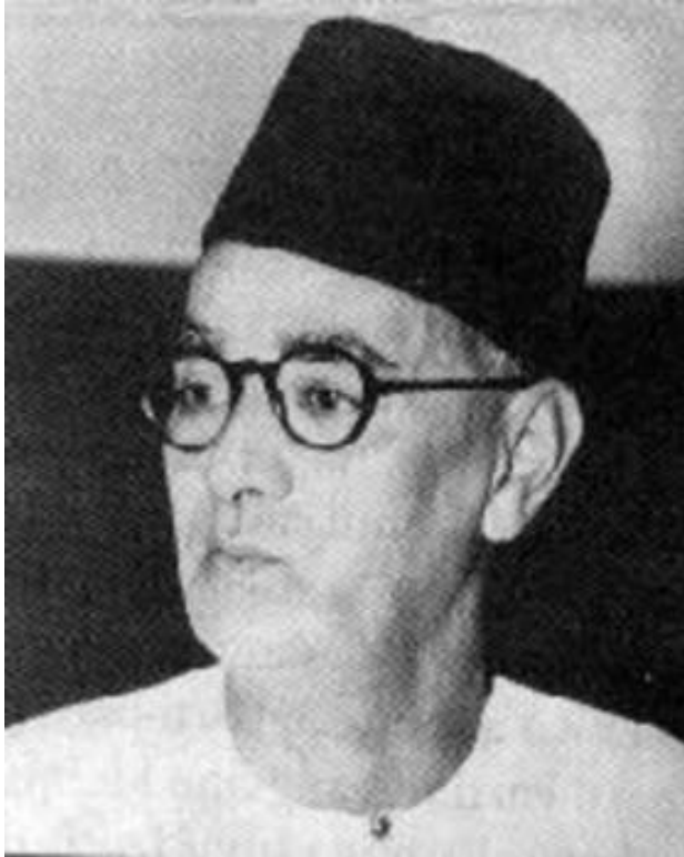
Dato Onn Jaafar

a) As a means of improving the competitive position of the Malays vis-à-vis the Chinese. B) As a gesture to reassure the Malays that H.M.G is mindful of their special position in their own country” He also requested that a Malay be appointed as Deputy High Commissioner. [47]