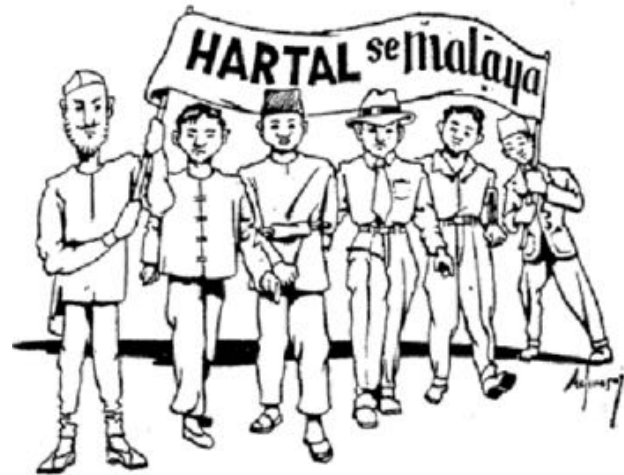
Pan-Malaya hartal, October 1947

AMCJA. [43] The Associated Chambers of Commerce of Malaya held a meeting on 18 January 1948 and agreed to boycott the Federal Legislative Council and the various State Councils under the new constitution.