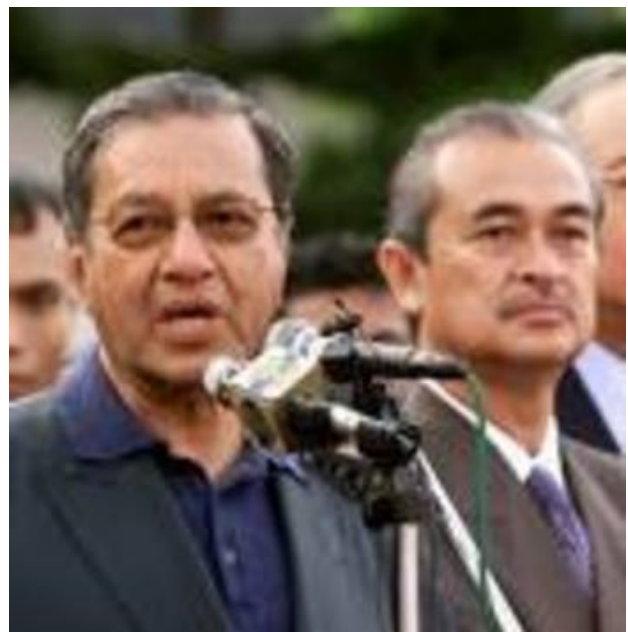
Mahathir Mohamad (L) and Abdullah Badawi (R)

ethnic groups. While producing a richer Malaysia, with the "privatisation of profits and socialisation of losses," he gave rise to a possibly eternally fractured society. It was his premiership which allowed the Deputy Prime Minister and then UMNO Youth Chief Najib Razak to threaten, during an UMNO Youth congress in 1987, to bathe a keris (dagger) with Chinese blood. It was during his period in office that anti-Chinese sentiments were encouraged and exacerbated, and it was during his period in power that most of the abuses of Malay ethnocracy noted below came to pass. His creation of a solely Malay capital at Putrajaya reflects excellently his attitudes to how he wanted this multi-ethnic nation to develop. There are sufficient good books on Mahathir’s period of rule to obviate the need here for even an overview of his period in power. [57] Various aspects of ethnocracy during the Mahathir years will be examined below.