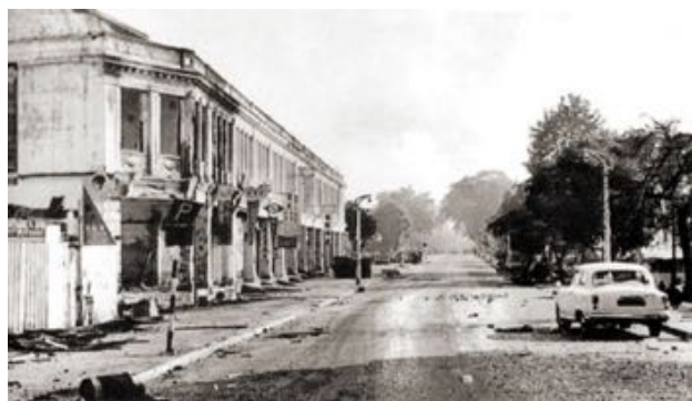
Aftermath of the violence of May 13, 1969

The violence which ensued on 13 May 1969, which is said by some contemporary commentators as having been planned and initiated by Deputy Prime Minister Tun Abdul Razak and Harun Idris, the Selangor Menteri Besar, resulted in hundreds dead, the Parliament suspended and a national emergency declared. A National Operations Council (NOC, which comprised 7 Malays, one Chinese and one Indian), led by Tun Abdul Razak took over Government. An obscene interpretation of the violence of 1969 that has persistently been used as one of the validations of the New Economic Policy was that it was that the violence was due to economic inequalities.