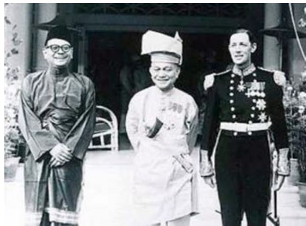
Merdeka: (From left) Tunku Abdul Rahman, first Yang di-Pertuan Agong Tuanku Abdul Rahman and MacGillivray standing outside King’s House in Kuala Lumpur after signing the Merdeka Agreement on Aug 5, 1957.

consisted of four representatives from the Malay rulers, another four from the Alliance government, the British High Commissioner, the Chief Secretary, and the Attorney General, ensuring that it was essentially the interests of the Malays which were being represented. Tunku Abdul Rahman was to write in his memoirs that he prodded his colleagues to agree to the terms by arguing that they could be amended later on — after independence: “It was, of course, not a perfect constitution ... But we knew we were going to be in power with an overwhelming majority and if any changes appeared necessary we would amend the constitution. ... So why waste haggling over it at that stage? I just told my colleagues to accept everything that was proposed” [49] The Constitution took effect on 15 August and on 31 August the Federation of Malaya became an independent country.