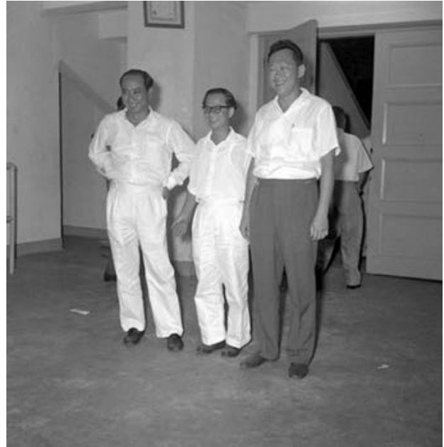
Lee Kuan Yew (R)

A Malaysian Malaysia means that the nation and the state is not identified with the supremacy, well-being and the interests of any one particular community or race. ...The special and legitimate rights of different communities must be secured and promoted within the framework of the collective rights, interests and responsibilities of all races. The people of Malaysia did not vote for a Malaysia assuring hegemony to one community. Still less would they be prepared to fight for the preservation of so meaningless a Malaysia. [54]