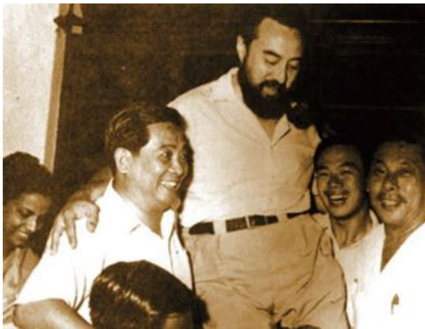
Lim Chong Eu (L), 1969

to pursue and protect the interests of the Chinese. Even when Chinese associations and educationists proposed the establishment of a Chinese-medium tertiary institution -- Merdeka University -- in 1968, the MCA expressed opposition to the idea. It was such attitudes which led to its disastrous showing in the 1969 elections. The DAP and the People's Progressive Party (PPP) [55] also gained support from the disenchanted English-educated members of the MCA. By 1968, another opposition party -- Parti Gerakan Rakyat Malaysia (Gerakan) -- had been created and, led by Lim Chong Eu, it also adopted opposition to Bumiputra rights as one of its key policies.