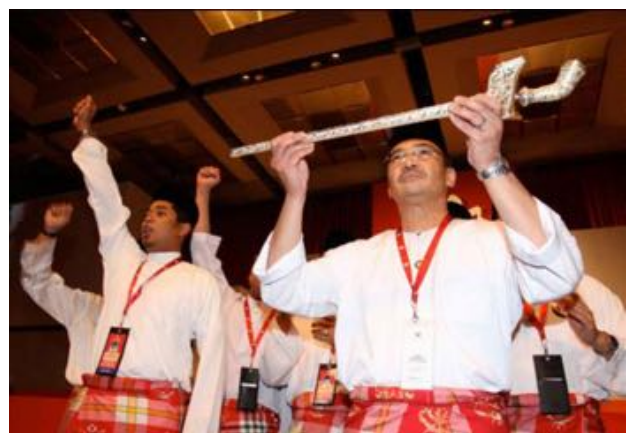
Hishammuddin Hussein with kris at UMNO conclave