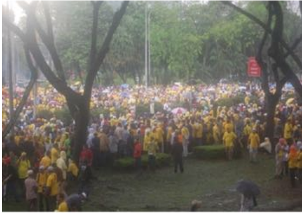
Street protests, Kuala Lumpur, 2007