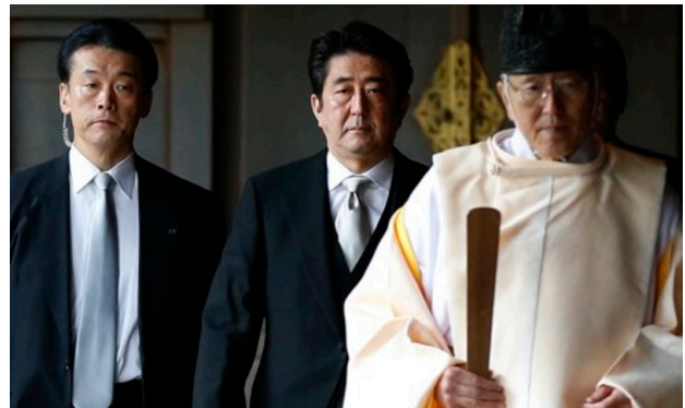
Abe (center) visiting Yasukuni Shrine

and rectify the “distorted image” of Japan's wartime past rooted in Japanese society. The image that he is referring to, one widely shared not only by Japan's Asian neighbors but also by its patron and ally the United States, is that of Japan as an aggressor nation in the Asia-Pacific War (1931-45). For Abe, the war was rather one fought for the defense of Japan against the Western colonial powers and for the liberation of East Asia.