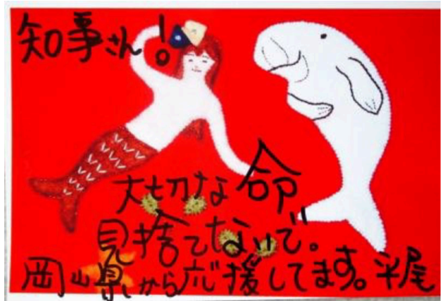
A Manga Mermaid

The designs might be diverse but the message is united: Henoko is one of the world's treasures and it needs to be protected - not buried beneath millions of tons of concrete.