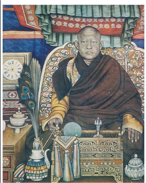
The last Bogd Khaan

There is no single document in Mongolian that has the character of an official Mongolian Declaration of Independence. The most sacred and foundational text that Mongols accept as initiating a new Mongolian state is the royal decree issued by the Jebtsundamba Khutagt on 29 December 1911 at his inauguration as the Bogd [Holy] Khaan of Mongolia, assuming the reign title of ‘Elevated by All’, a decree on distributing favours and titles to meritorious persons who had contributed to the founding of Mongolia. 24