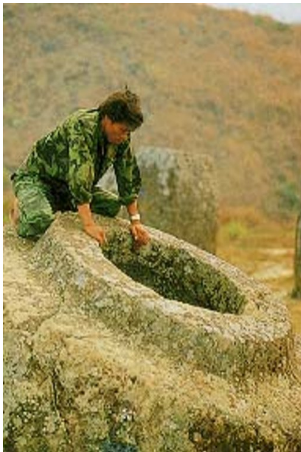
A Lao soldier peers into a mammoth jar at Ban Ang, the principal jar site.