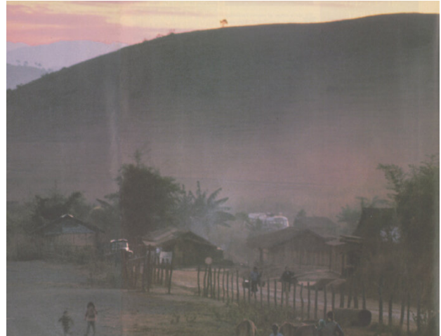
The main road near Phomsavan, on the Plain of Jars. Most Lao are subsistence farmers.