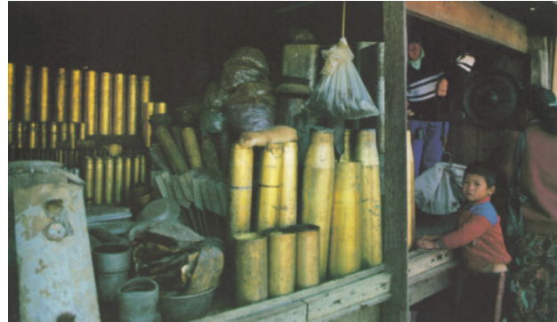
In a shop in Phomsavan, right, recycled shells are offered for sale as containers.

Parmentier identified three types of jars at Ban Ang: squat-shaped ones, slender ones, and others that were "almost sections of squared or rectangular prisms, with well-rounded corners." And he was able to form an idea of what a typical jar contained before it was disturbed: one or two black pots, one or two hand axes, "a bizarre object which we call a lamp," often a spindle weight of iron, glass beads, drilled carnelian beads, earrings of stone or glass, bronze bells, and frequently the debris of human bones.