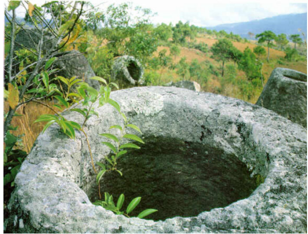
At Lat Sen, sandstone jars are arrayed on the top of a steep hill.