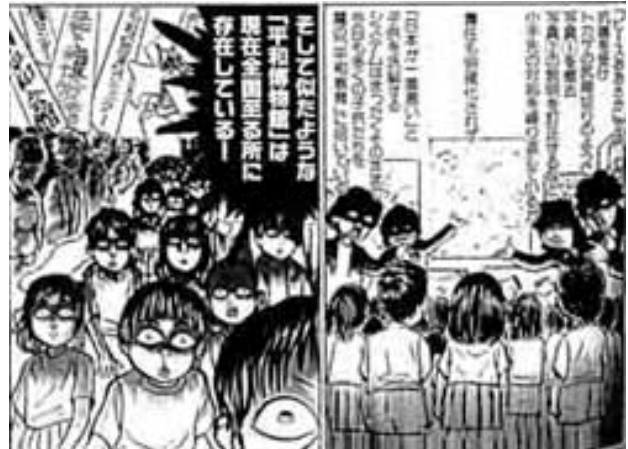
Kobayashi denounces the brain-washing of children at peace museums

Japan's past and its role as a source of national pride and identity became widely available and popularized by the late-1990s and can be summarized as follows: i) it is natural and healthy to love one's country, and Japanese people should be proud of Japan; ii) post-war Japanese public discourse had been dominated by the left, which has presented a "distorted" and "masochistic" history to the public and children in particular;