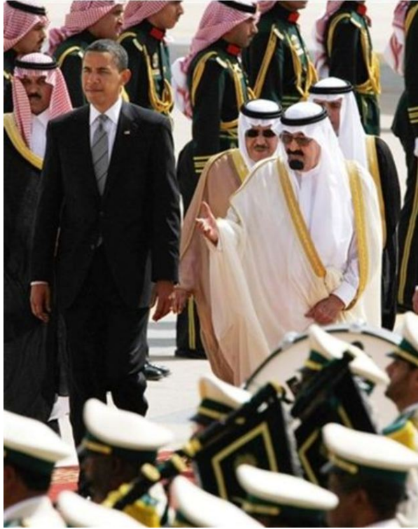
Obama with Saudi King Abdullah, 2010

In short, the wealth generated by the Saudi-American relationship is funding both the al Qaeda-type jihadists of the world today and America’s self-generating war against them. The result is an incremental militarization of the world abroad and America at home, as new warfronts in the so-called War on Terror emerge, predictably, in previously peaceful areas like Mali.