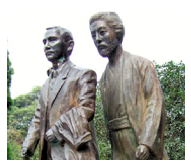
A plaque at the foot of bronze statues of Sun Yat-sen and Toten Miyazaki refers to their "sincere friendship." Photo by Kazuo Sato in the courtyard of the Nanjing Historical Remains Museum of Chinese Modern History

About a century ago, the wheel of history took a major turn with the Xinhai Revolution in China. The dynastic government stretching back more than 2,000 years was overthrown, which led to Asia's first republic.