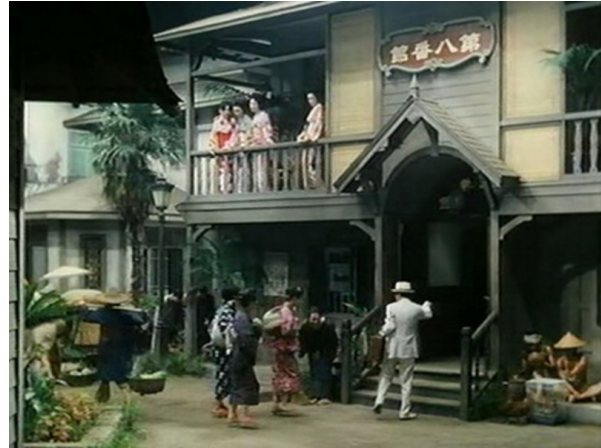
Karayuki in film. Sandakan 8.

The work of such agents, which involved canvassing people in one place and transporting them by sea over great distances to another destination, has been documented in the (sensationalist and unreliable) biography of Muraoka Iheji dealing with his role in shipping Japanese women across Southeast Asia through international networks of “slave-trading.” 32 The feminist inspired writings of Yamazaki also focus on the procurer and justifiably point out the significance of this agency whereby men and women were bound up in relations of power in which women were dominated, highlighting the effects of the subordinate position women were placed in.