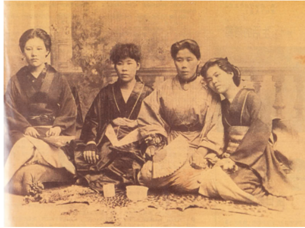
Karayuki in Singapore, Meiji era

Sex in Japan's globalization asks a different set of questions: what was the state's investment in promoting, prohibiting or controlling overseas prostitution by Japanese women? But it also goes on to locate prostitution in relation to Japan's nation-building agenda and to assess the nature and possibility of women's agency under conditions of international prostitution.