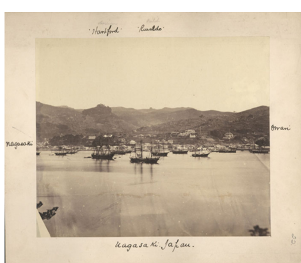
Nagasaki port 1871 with British and American ships

From the 1850s onward, innovations in marine technology in the form of steam-driven ships and the expansion of land and submarine telegraphic communications firmly incorporated Japan into the European-based networks of power and exchange. 10 The Tokugawa authorities signed commercial treaties under duress with the United States, the Netherlands, Russia, Britain, and France in 1858. As a result, the ports of Kanagawa, Nagasaki, and Hakodate were opened to foreign trade. Trading privileges were extended to foreign merchants in 1863 to include the ports of Niigata, Hyogo, and the cities of Edo and Osaka. The increase in steamers calling to ports in Japan also saw the demand for coal soar. 11 Encouraged by the demand for coal by energy-hungry steamers, the Japanese government investigated ways in which Kyushu coal mines could be exploited for nation-building. 12 The Meiji government invested heavily in the development of the Takashima and Miike mines in western Kyushu on the calculation that coal exports were a lucrative source of badly needed foreign exchange.