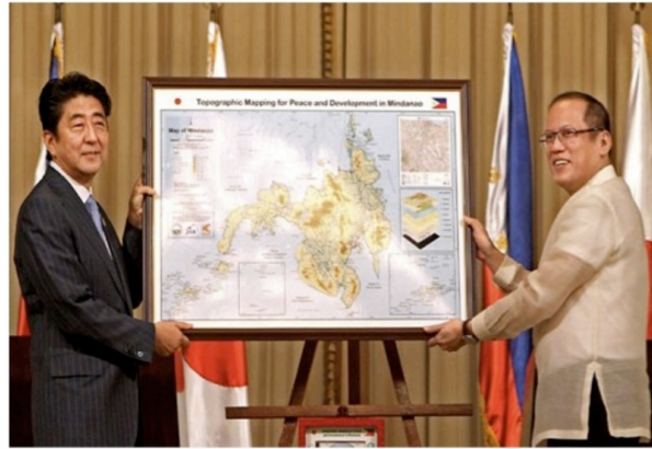
Prime Minister Abe (left) and President Aquino in Manila, July, 2013