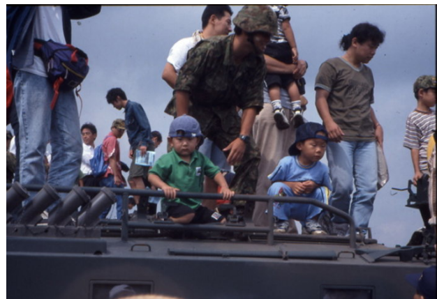
Figure 4: Some visitors are eager to familiarize themselves and their children with the tanks and other military equipment that had been used during the live firing demonstration. Being photographed in the vicinity or on top of the tanks adds excitement and creates an opportunity to review the images at home.

Unlike the playful characterization of a military conflict in cartoons, however, the demonstration has no uncertain outcome. There is very little space for improvisation or individual creativity. Rather, the event is tightly scripted and thus the emphasis shifts to its more dramatic aspects. Hence, the live firing demonstration also involves the spectacularization of violence through the combination of fire, colors, noise, smell and movement. It is this spectacularization that turns actions related to soldiering into entertaining displays.