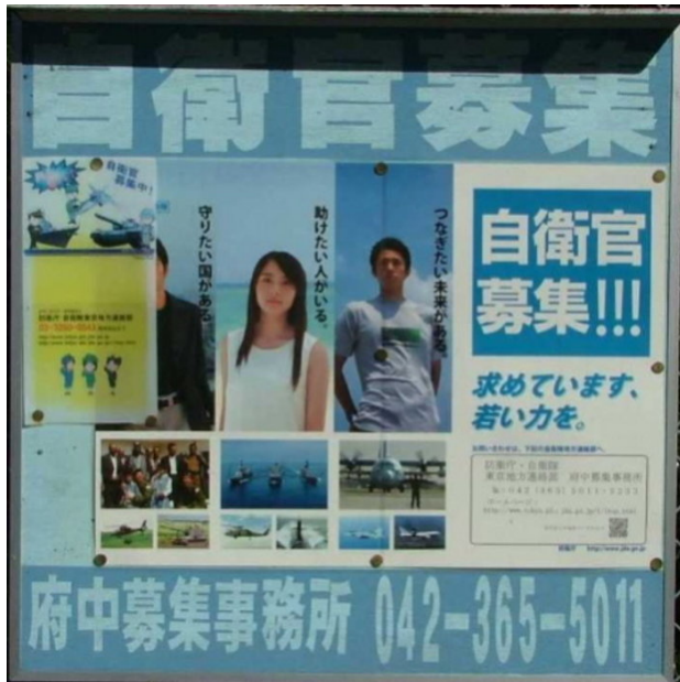
Figure 1: “Self-Defense Force service members recruitment: We appreciate it - young strength. There is a future to which I want to connect. There are people I want to help. There is a land I want to protect” (Self-Defense Forces recruitment poster, 2005. Photographed by Jennifer Robertson).

recruitment materials, the Self-Defense Forces rely primarily on vague slogans, a decisively non-violent symbolism, an unambiguously gendered imagery, a glaring absence of references to the nation, patriotism or other concepts that the Japanese state once had exploited for the purposes of war and imperialism, and the frequent use and appropriations of English phrases. In Japan, public relations posters - more than 100,000 copies of each are printed and distributed all over Japan - address an anonymous wider society that happens to live or walk by billboards on which they are posted next to information about garbage collection, fire exercises, festivals, obituaries, and other announcements that are of interest to the local community.