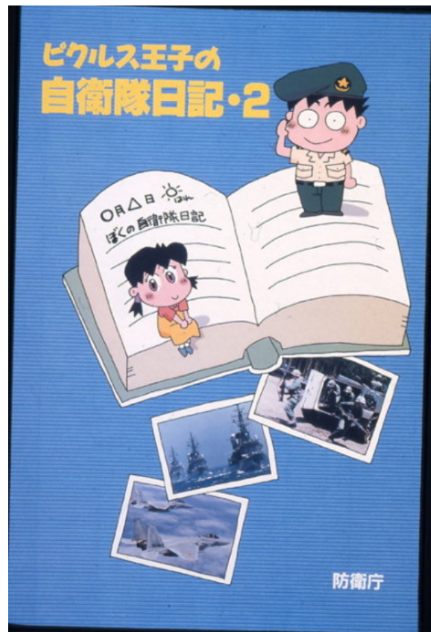
Figure 3: Throughout the two cartoon volumes, Prince Pickles: The Journey to Peace and Prince Pickles Self-Defense Forces Diary II , Prince Pickles frequently changes his outfit from the various uniforms of the Self-Defense Forces to fantasy costumes that emphasize his superhuman spirit and commitment to world peace.

fat, mean-looking emperor stuffs himself with food and wine. His character as a despot who suppresses his people is indicated by his subservient and anxious butler. Eventually Gōma’s butler tells his master that there will not be any food left for the winter if he continues to eat so much now. Gōma gets angry and announces that if they do not have food of their own they will have to steal it from somewhere else.