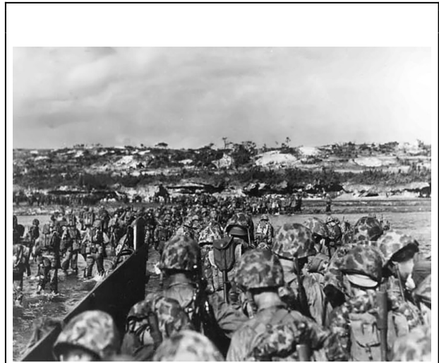
Marines come ashore on Okinawa