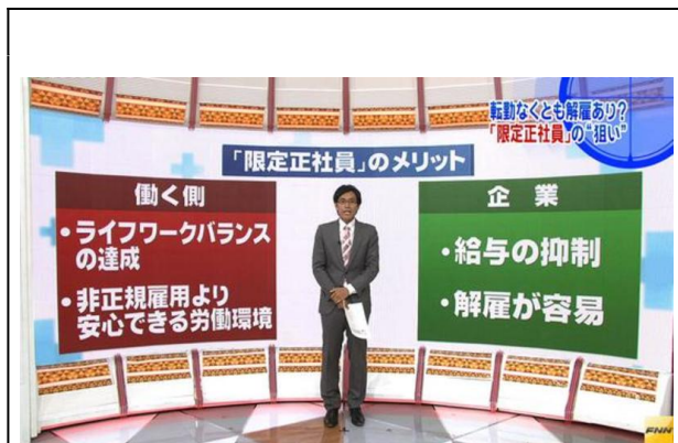
A television news show presents the conflicting aims of limited regular employment for labor and capital. For workers: achievement of work-life balance and more reliable labor environment than non-regular employment. For companies: ability to hold down wage costs and dismiss workers more easily.