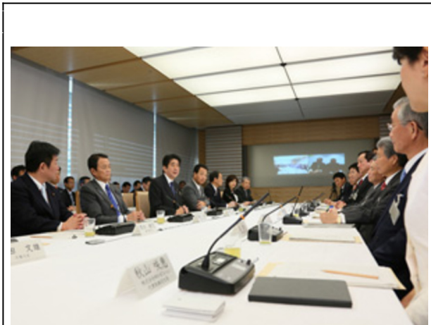
The Abe cabinet discusses growth strategy

and underpay and poor career possibilities for non-regulars, who get less respect and may receive less than a living wage for a nearly 40-hour workweek. The relative poverty of the working poor is linked to delays in marriage and consequent birthrate declines. This growing imbalance in (and between) the lives of regular “core” and non-regular “peripheral” workers is starting to threaten social reproduction and Japan’s long-term social stability.