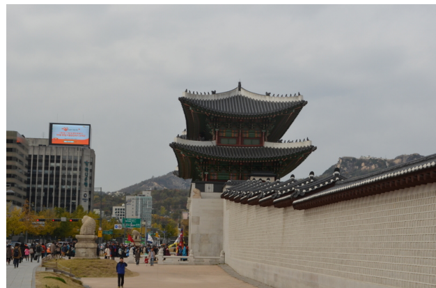
Figure 6.4 The Main Gate of the Kyŏngbok Palace, restored to its original position.