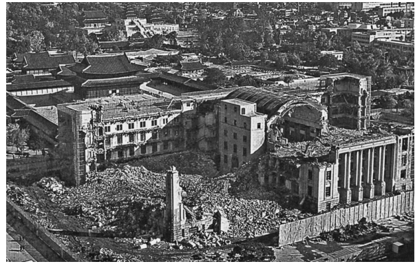
Figure 6.3 Demolition of former Japanese Government-General Building from Ministry of Culture and Sports, Koo Chosōn chōngdokbu gōnmul (former Government-General Building in Korea) (Seoul: Ministry of Culture and Sport 1997).

The actual dismantling of the GGB began on the 50th anniversary of the Liberation Day on 15 August 1995. A grand national ceremony was broadcast throughout the country. Accompanied by fireworks, dances, and cheers, the highlight of the ceremony being the tearing off of the steeple on the top of the dome of the GGB. The decapitated steeple was exhibited at the site for a while and later moved to the Independence Hall of Korea, near Seoul. 11 A series of events to commemorate certain historical days or to celebrate festivals to revitalize national spirit was held at the site during the dismantling process (Ministry of Culture-Sports 1997: 356-357). The demolition of the GGB, however, had to be delayed by about a year due to litigation on the part of some citizens. In 1995 and 1996, civic groups opposed to the demolition of the GGB filed suits in the Seoul District Court, against the government and the Hyundai Construction Company, which was undertaking the actual work. However, the court rejected all these applications, affirming in its verdicts the need to revitalize 'national spirit and energy' by demolishing the GGB and restoring the Kyōngbok Palace (Ministry of Culture-Sports 1997: 366-370).