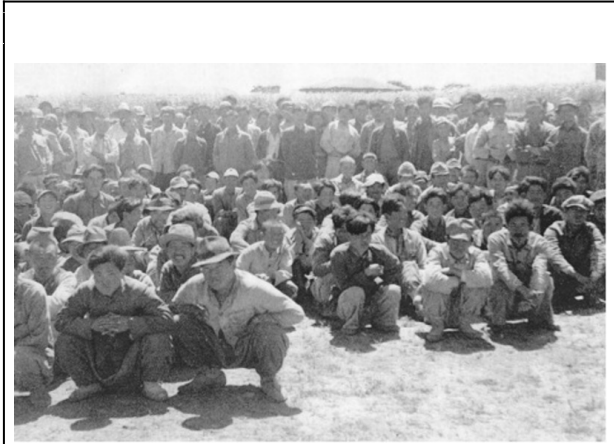
Roundup of Jeju islanders

My father lost all but one of his cousins and six of his seven uncles. His grandfather, my great grandfather, had had eight sons, six of whom were killed in the years 1948-1949. One of the remaining two, the youngest, had traveled to Manchuria to practice law during the colonial period, later opting to be repatriated to northern Korea, while the other, the middle one (my grandfather), was living in Japan. It was understandable, therefore, that I grew up hearing about 4.3. I am not an exception in this regard: other friends whose families originally came from Jeju were also raised to regard it as shameful not to know about 4.3. I even had a few classmates whose mother or father fled Jeju for Japan during those years. The main thing that we heard, however, was that some unspeakable, inexplicable, and indescribably horrific things had happened on Jeju in 1948 and that thousands had been killed, as if to say that this was something beyond horror, violating human sanity. I was nevertheless surprised to learn relatively recently that there had been a fifty-year ban in South Korea on such activities as investigating or conducting research related to the 4.3 Uprising, in addition to teaching about it in history education or even talking about it.