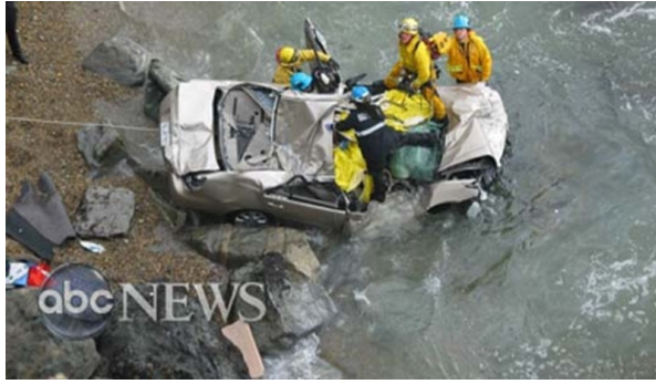
Reporting on Toyota acceleration crashes

Toyota is hardly the only car giant to experience these problems. General Motors recalled over three and a half million cars in 2004. Defective windscreen wipers forced Honda to fix 3.7 million cars in 2005. Around the same time as Toyota was on the rack in its core US market, Ford discovered a problem with faulty cruise-control switches that ultimately triggered 14 million recalls - the largest in automotive history. The Japanese weeklies pointed out - correctly - that Ford had a far worse record for quality: another Ford recall in 1996 affected 7.9 million cars. But Toyota had built much of its reputation on keeping tight control over quality.