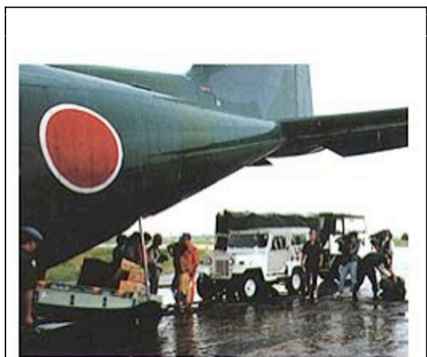
Loading equipment and materials onto ASOF C-130H carrier aircraft

The first time the SDF were dispatched abroad was in support of the U.N. Peacekeeping Operation in Cambodia, in 1992. In 1995 the Commander of that operation, an Australian general, participated in a symposium in Tokyo, which I attended. During a coffee break I asked him how it was to have under his command a party of uniformed men (I think they were all men) who didn’t have the right of belligerency. He looked around to see who was listening, lowered his voice, moved a little closer and said, “I had to wrap them in cotton wool!” A person standing nearby asked, “Weren’t they sent home early?” “No,” he said, “They were sent home according to plan.” Then a smile flitted across his face, and he lowered his voice again, saying, “Of course, you have to understand that when I was deciding the order in which to send back the units, the Japanese unit was not one of the ones I wanted to keep to the end.” The SDF were in Cambodia for political reasons, made no contribution to actual peacekeeping, which sometimes requires military action, and were in fact a major headache for the commanders (they were used for road construction, but we hear that the roads they built washed out fairly soon).