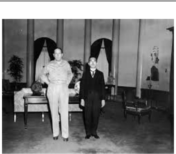
MacArthur and the Emperor

Of course, the people who were holding power under the existing system on the whole (with some notable exceptions) hated all this, and tried to resist and sabotage it in every way they could. So when they say it was forced on them, that accurately describes their experience. But it was not forced on “Japan” by “America”; rather it was forced on the Japanese ruling class by an alliance that existed very briefly in 1945, between the Occupation and the Japanese public. Moreover, aside from whether MacArthur and his advisors’ motivations were good, bad or indifferent - whether they were acting as New Dealers, conquerors or (as is more likely) a mishmash of the two - the power that was taken from the Japanese political class was not carried back to Washington DC, but transferred to the Japanese people.