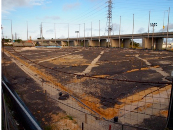
The soccer pitch in Okinawa City where the 22 barrels were unearthed.

Clapp stated, “The Okinawa data, if accurate, are comparable to recent hot spot data collected in Vietnam. About half of the dioxin levels are above what (scientists) consider significant contamination.”