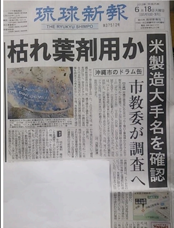
The discovery made headlines in Okinawa, including the Ryukyu Shimpo newspaper.