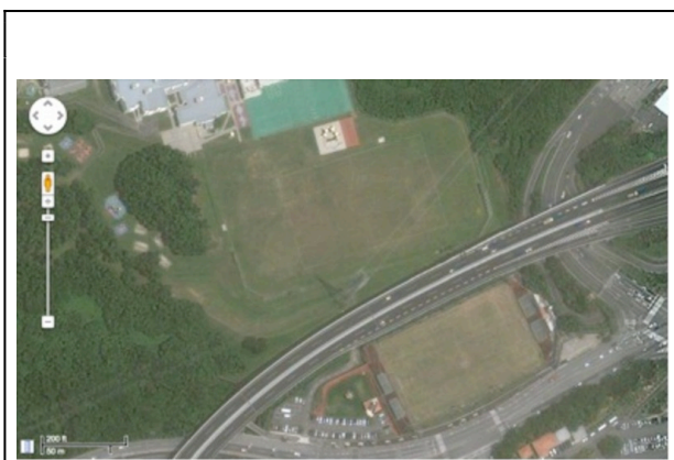
In this aerial view, the soccer pitch (bottom right) is seen separated by an

Directly adjacent to the barrels' dumpsite - on the other side of the fence - within Kadena Air Base, there are two Department of Defense schools - Bob Hope Primary School and Amelia Earhart Intermediate School. Inquiries to both the Pentagon and United States Forces Japan as to whether dioxin checks would be conducted there were unanswered at the time of publication.