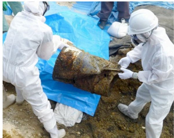
Workers unearth the barrels discovered beneath a soccer pitch in Okinawa, City.

revealed levels 280 times legal limits. Both 2,4,5-T and TCDD are two of the substances found in Agent Orange and other Vietnam War era defoliants. At least three of the barrels were labeled with markings from Dow Chemical Company - one of the primary manufacturers of Agent Orange.