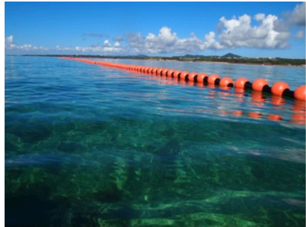
On the edge of the newly-created exclusion zone on Henoko Bay

Take for example, hip-hop artist Kakumakushaka who raps about the U.S. occupation of Okinawa - including Tami no Domino , a blistering track about the 2004 helicopter crash. Then there are the designers for fashion label Habu Box whose t-shirts feature bright hibiscuses flowering from the barrels of G.I. rifles and jackets embroidered with U.S. Ospreys clashing with giant shiisa - the mythical lion-dog that can often be seen guarding Okinawan rooftops.