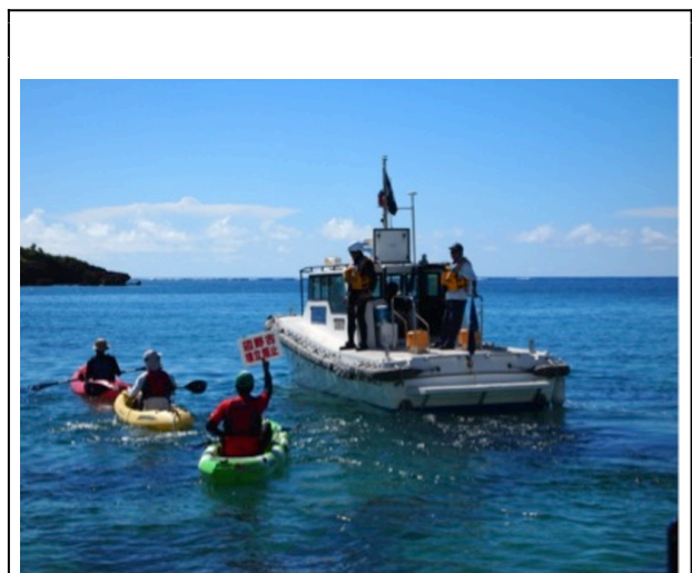
Japan Coast Guard Battles Citizen Demonstrators in Kayaks

Instead of waiting for the outcome of these legal cases, the Japanese government has stooped to new lows in dealing with demonstrators. Last month, with U.S. backing, it created a 2-km exclusion zone in the seas around Henoko and threatened to prosecute anyone entering it under the keitokuhō , a long-mothballed criminal law dating back to 1952 when the Japan-U.S. security treaty first came into existence. In addition, Tokyo ordered the National Police Agency to create a special team to suppress protesters and installed sharp metal grills outside Camp Schwab to prevent sit-down demonstrations from blocking the gates. 15