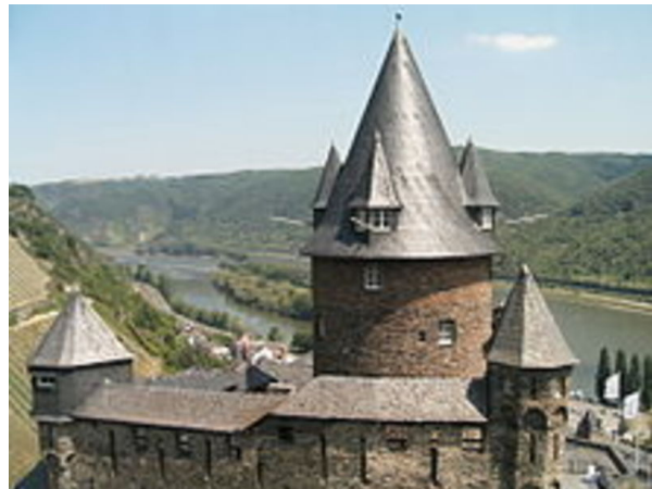
Fig. 6 - Stahleck Castle

Setting aside the question of Communism's ideology, the people at its core are intellectuals who have never been intimately connected with the land. Furthermore, their ideology is something that has been directly imported from abroad and has no roots in the history of that country. Taking their claims to be absolute, they butcher those who oppose them without hesitation. This is something that others and I can in no way approve. While it is true that Nazis and Fascists also insist on totalitarianism, in one sense it can be said that theirs is a form of resistance to Communist actions. Or it can also be understood as turning the Communists' methods to their own advantage.