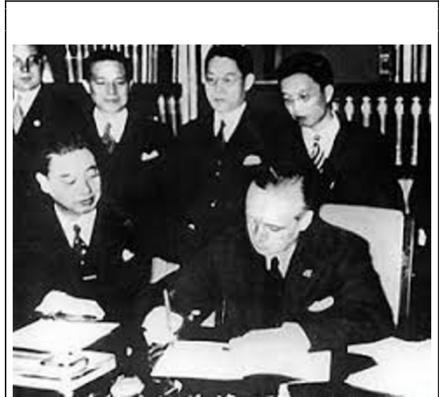
Fig. 7 - Signing of Anti-Comintern Pact

In short, the societal context within which a piece is written, coupled with the writer's personal background, are important and often neglected methods for determining the meaning of a text. In Suzuki's case, the question is not only the meaning he himself meant to convey, but also, what the editors of a major Buddhist newspaper would have allowed him to say in October 1936. As Sueki Fumihiko, one of Japan's leading historians of modern Japanese Buddhism, points out: "When we frankly accept Suzuki's words at face value, we must also consider how, in the midst of the situation as it was then, his words would have been understood." 6 In other words, what would Suzuki's readers have thought he meant?