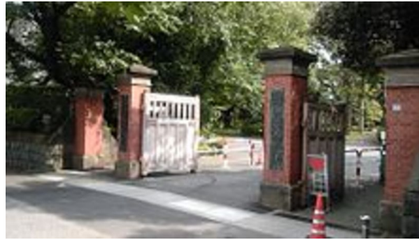
Fig. 9 - Entrance to Gakushūin

socialist” following his return to Japan. Yet, even if this were true, how might it help to explain a possible sympathy for the Nazis?