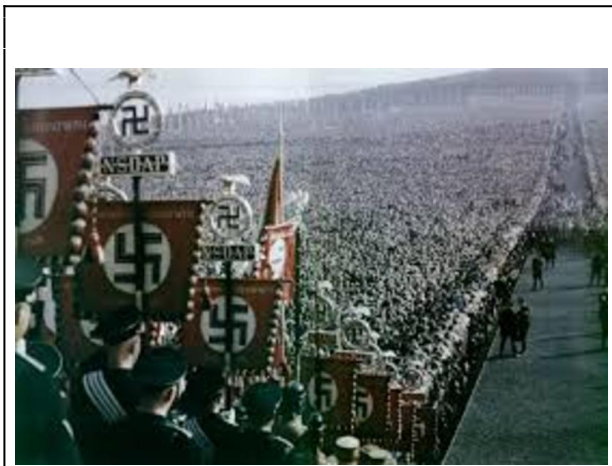
Fig. 4 - 1936 Nazi Rally in Nuremberg

On occasion, in England, too, I have encountered Jews. I recently met a young self-professed wealthy poet who had been persecuted and expelled from Germany. After listening to his story, I felt sorry for him because he suddenly found himself living in poverty in a foreign land. As regards individuals, this is truly a regrettable situation.