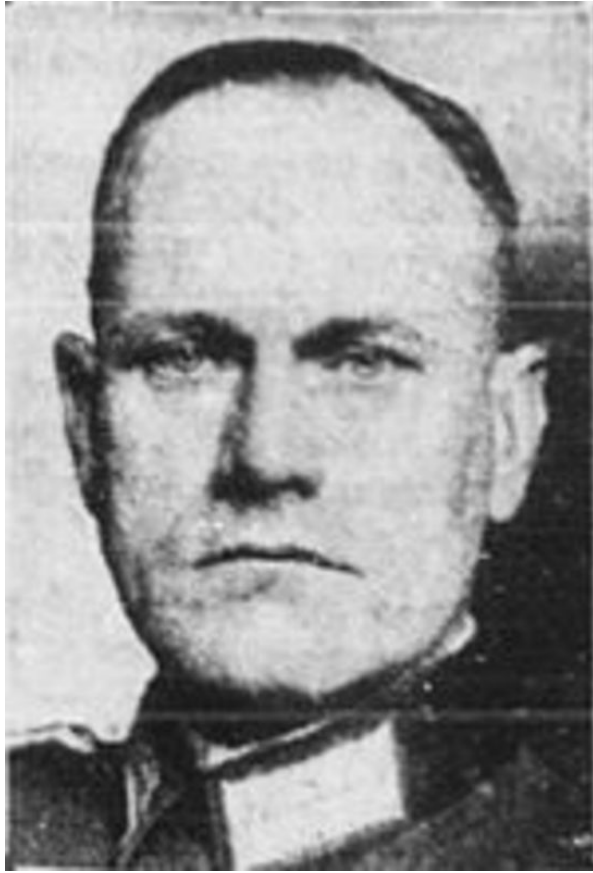
Fig. 10 - Ambassador Eugen Ott

Further, Suzuki's contact with leading Nazis was by no means limited to Dürkheim alone. On January 18, 1939 Suzuki wrote: "Went to Tokyo soon after breakfast. Called on Graf. [Graf] Durkheim at German Embassy, met Ambassador [Eugen] Otto [Ott], and Dr. [space left blank] of German-Japanese Institute. Lunch with them at New Grand." 22 On February 4, 1943 Suzuki took part in a dinner party to honor the ambassador: "Went to Imperial Hotel to attend dinner party given to Amb. Ott and his staff," 23 and on February 16, 1943 Suzuki received "a box of fruits in recognition of my presence at a dinner party in honor of Amb. Ott of Germany." 24