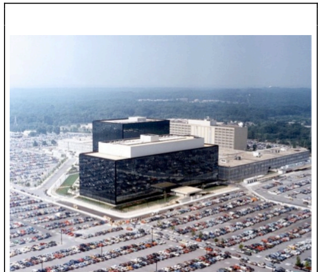
National Security Agency Headquarters, Fort Meade, Md

information the US government labels secret. 19 Why were these two young men selected to serve as guardians of the American “government of secrets?” The answer is that the body of information classified by the U.S. government is so vast that a huge army of operatives must access this “secret” information in order to do their jobs every day. According to the annual report of the U.S. Director of National Intelligence, more than four million people hold a security clearance that enables them to view classified information. 20 Among them, an astounding 1.4 million hold the “Top Secret” clearance, just like Manning and Snowden did.