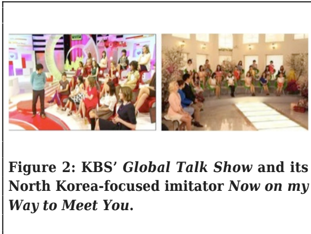
Figure 2: KBS' Global Talk Show and its North Korea-focused imitator Now on my Way to Meet You .

with Northern escapee beauties.”) 11 Both shows have frequent recourse to conversations about cultural difference, a fondness for quiz-like games to pique audience interest and elicit information about such difference, and a studio arrangement in which the presenters, female panelists and male panelists are seated separately around a central floor area for performance.