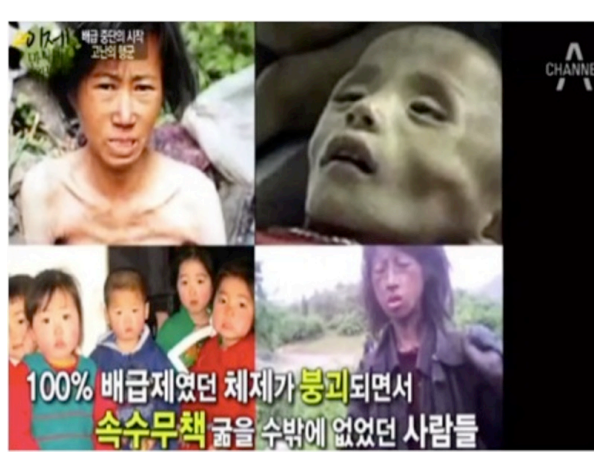
Figure 4: A segment on the Arduous March. The caption reads "People who were helpless to avoid starvation as the 100% state distribution system collapsed."

Although the emotional manipulations are palpable, they fall readily within local traditions of melodrama and are not merely expected but even perhaps desired; rather more troubling is a cavalier attitude towards documentary accuracy in the montage: the footage of one woman in the piece comes from the end of the 2000s, 22 suggesting that the show's producers were more concerned with images of suffering in the DPRK than historical veracity. Hackneyed shots of goose-stepping soldiers are included as well, carrying with them the implicit subtext that the decisions of an uncaring regime to prioritize military needs extended the scale of disaster. As the montage ends, a caption " nunsiuri bulgeojin talbuk minyeodeul " ("the reddened eyes of refugee beauties") drives home the cruelty of visiting human-created catastrophe upon the innocent, who also happen to be—lest the viewer has forgotten— attractive young women, while the studio camera pans to shots of the talbukja panelists composing themselves as the film clips fade. The video returns to discussion of the Arduous March period through the memories of the panelists, and does not stint on