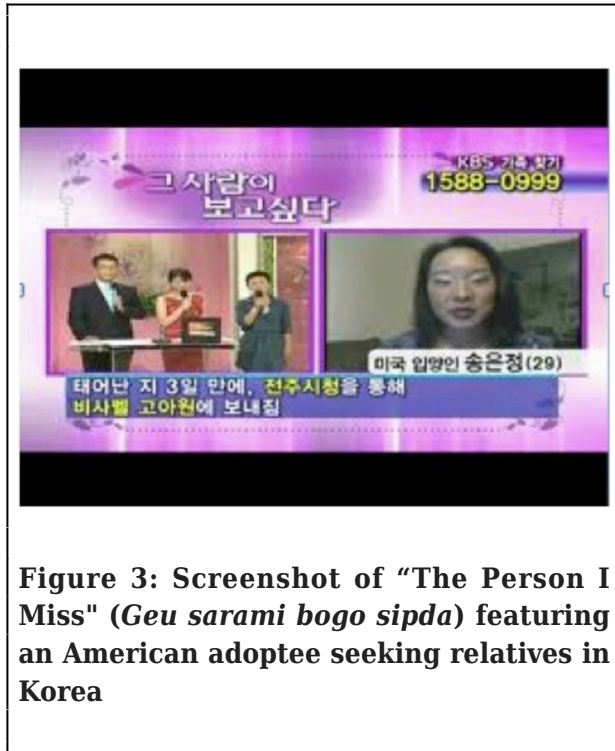
Figure 3: Screenshot of “The Person I Miss” ( Geu sarami bogo sipda ) featuring an American adoptee seeking relatives in Korea

neighbors, toward whom viewers could feel a mixture of sympathy in remembering South Korea’s own similar tales, and relief in an acknowledgment that the nation was moving on (Epstein 2009b).