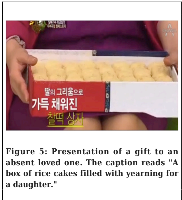
Figure 5: Presentation of a gift to an absent loved one. The caption reads "A box of rice cakes filled with yearning for a daughter."

underscored by subtitles that follow her words and make an explicit connection between her incompleteness and that of the nation: "I miss you. I want to see you wherever you are. Like the heart of your mother who longs for unification to happen soon, please wait for unification and your mother. I love you." In this respect, talbuk seuteori share similarities with the narratives in Geu sarami bogo sipda , each of which can be read at the level of national allegory. At a more personal level, however, narratives in Geu sarami bogo sipda are characterized by more ambiguous and abstract senses of separation, in that many people are trying to reconstruct dim memories of how they came to be separated from other family members. In Imangap separation is recent and sharp, the grief often searingly fresh.