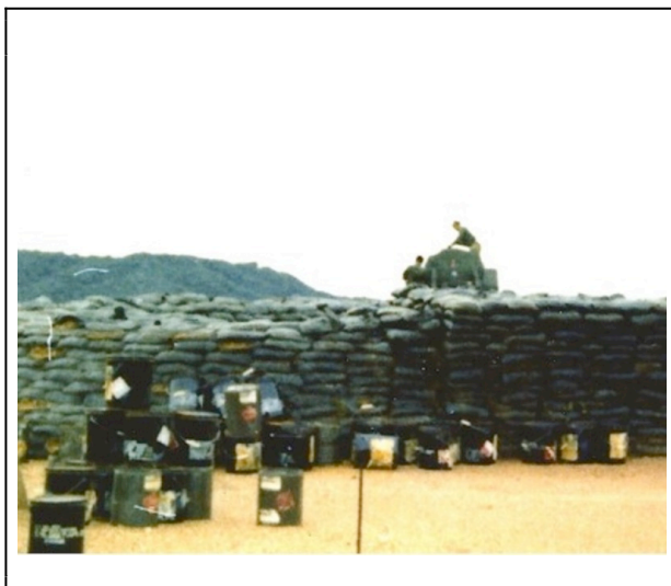
Barrels of unidentified chemicals lie strewn across land in the Northern Training Area, 1972.