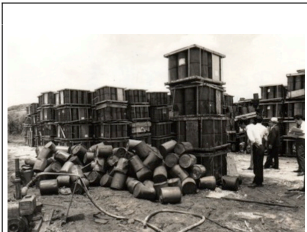
Okinawa officials visit the dumpsite of U.S. surplus

In the 1970s, the Pentagon showed more concern over potential PR damage than the risk to human health; today its stance towards the discovery of the dioxin-contaminated barrels in Okinawa City seems identical. Its denials attempt to protect its image of a good neighbour - but its failure to take action potentially sacrifices the health of local Okinawans, its own service members and their dependants. Although the Okinawa City dioxin site is located adjacent to two Department of Defense schools, it appears that the parents and teachers there have not been informed.