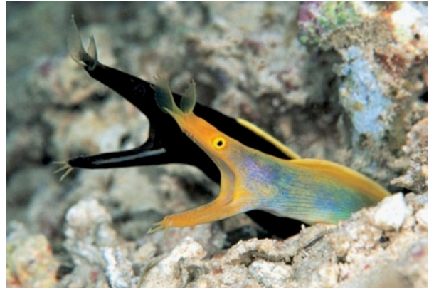
Leptocephali eel larvae captured on film off Indonesia. One of 800 varieties of eel, only a few of which are eaten.

eels from eggs. Instead, they rely on wild young caught in rivers and coastal waters worldwide known as two-inch-long “glass eels.” Until very recently scientists knew little about the life of the animal in the open ocean, where sexual maturation and spawning take place.