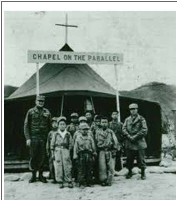
US military church and the US and South Korean chaplains together with Sunday school children. Late 1950s, South Korea. Source

Christian denominations in its chaplaincy services. This fact testifies to the degree of Christian influence inside the South Korean elites of the 1950s, and also to the paramount importance of Christianity to Syngman Rhee's state, as well as the degree of Christian loyalty to the militantly anti-Communist South Korean regime.