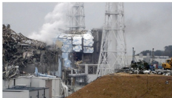
Damaged reactors at Fukushima Daiichi

Japan's searing summer of 2013 saw the lid slide further off Fukushima Daiichi and its Pandora's box of radioactive and political crises. The company in charge, Tokyo Electric Power Company (Tepco), already Japan's most distrusted firm, 2 was irredeemably exposed as dangerously incompetent. A slew of reports concerning leaks of high-level radiation led to increasingly concerned appeals, from within Japan and from overseas, for the Abe Shinzo government to take over at Fukushima Daiichi.