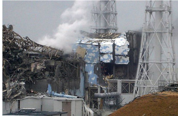
Fukushima Daiichi Reactors Explode

“After the explosion in Fukushima Daiichi Unit #4 the Japanese were not able to get enough water into the building to keep the spent fuel pool cool,” Lochbaum said. “So the US airlifted a concrete pumper truck all the way from Australia to an American naval base in the northern part of the island. And the Japanese would not let it leave the base because it wasn’t licensed to travel on Japanese roads. Given the magnitude of their problems, that seemed to be the wrong priority.”