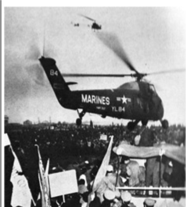
Hagerty Incident (1960)