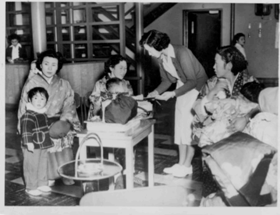
ABCC screening of atomic victims

The ABCC research focused on external exposure from radiation released during the first minute after the atomic blast. Radiation released after the first minute of the blast is known as residual radiation. Residual radiation includes radiation released from matter that has undergone neutron activation through the absorption of neutrons from initial radiation, and radiation released from radioactive fallout. At the time there was much debate over the destructive power of initial radiation from a nuclear weapon. So the fact that the ABCC was keen to focus primarily on initial radiation and reluctant to examine the longer-term effects of residual radiation indicates that the driving force behind the ABCC study was to better understand nuclear war, not the science of radiation.