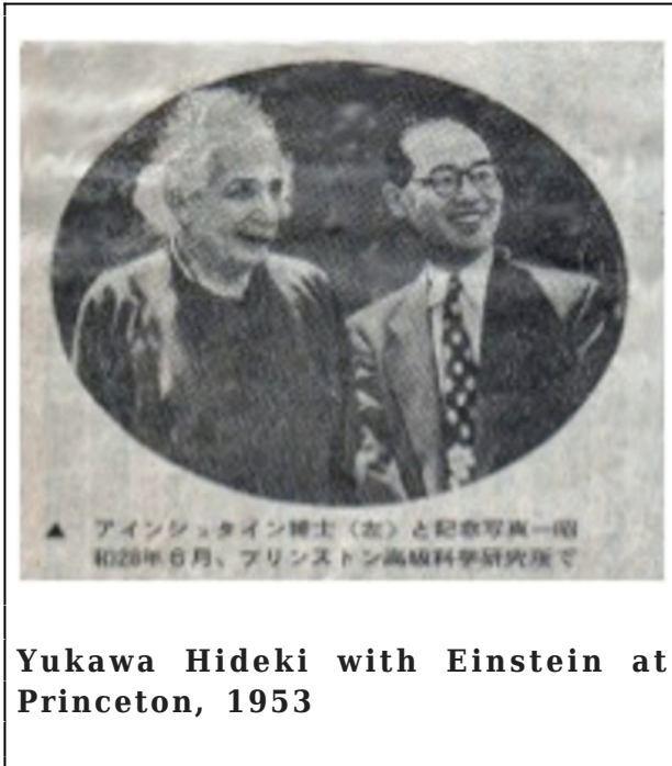
Yukawa Hideki with Einstein at Princeton, 1953

In the material that Dr Sakata left behind, I discovered he had come up with many new proposals which, even in their original form, would be applicable to the present day, such as one outlining the need for a safety regulatory committee to give top priority to safety, independent of pro-nuclear power government agencies.