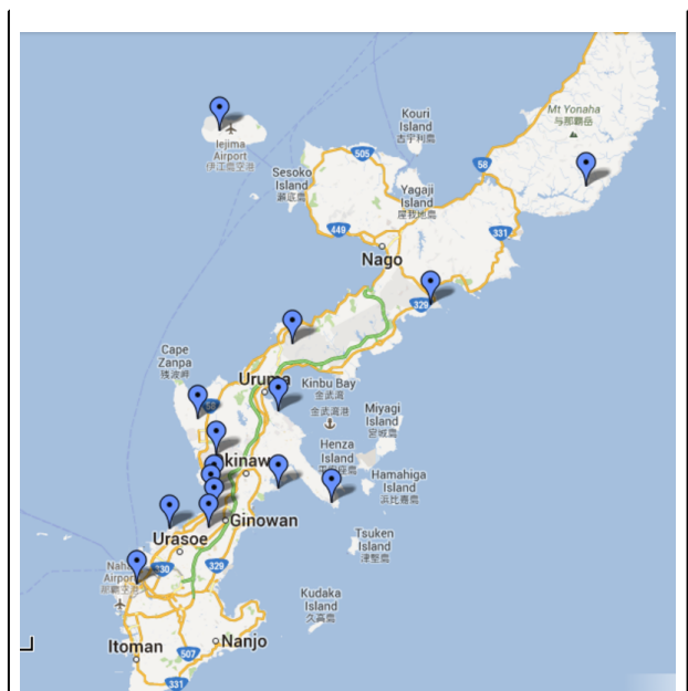
Map of Alleged Locations of Agent Orange on Okinawa ( link )

Suggestions that these poisonous substances were widely used on their island have worried Okinawa residents. Stories about the usage of Agent Orange have repeatedly made the front page of Okinawa Times and Ryukyu Shimpo as well as becoming the basis of four TV documentaries - including the award-winning Defoliated Island ( an English version of which is viewable here ).