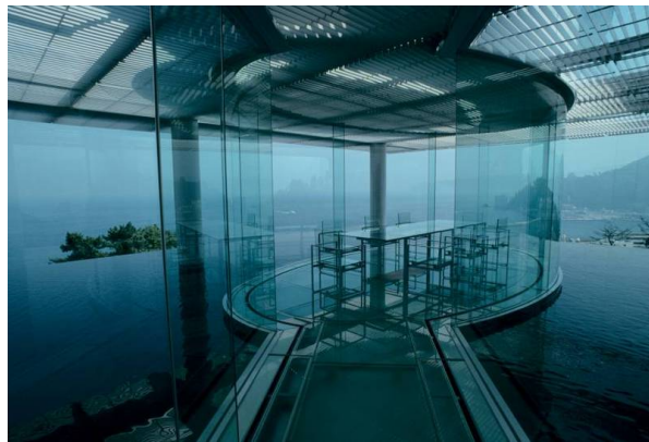
Making a connection: Kuma Kengo's 'Water/Glass' structure in Atami, Shizuoka Prefecture, attempts to connect architecture with the sea by means of a veranda of water.

"I wanted to go to a place that wasn't neat and tidy, somewhere dangerous. I was bored, and it had something to do with the era and something to do with myself too."