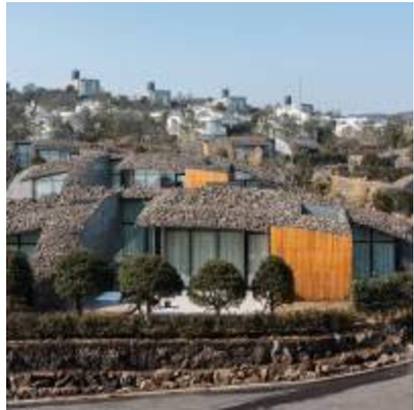
Jeju Ball Hotel

There is a porousness in Kuma’s structures that enhances the qualities of his materials. This is even true of some stone in his work. He laid volcanic rubble over the low sloping roofs of the buildings of the Jeju Ball hotel on South Korea’s largest island of Jeju. (The island boasts more than 300 lava cones.) The roofs and the ground are linked in texture, and light from skylights scatters shadows. There is a randomness to the way the light falls and fragments. The connection here, between the natural and the artificial, is produced in the eye of the beholder.