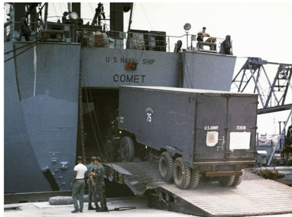
USS Comet - one of the ships used to transport Agent Orange to Okinawa

"Transport ships came in (from the United States) and we would move drums of Agent Orange. We worked 12 hours around the clock until we'd unloaded the ship," he said.