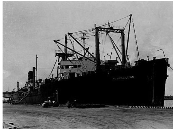
SS Transglobe - decorated Vietnam War transport vessel

The SS Transglobe (highly decorated during the Vietnam War for having come under enemy fire more than any other civilian ship), the USS Comet and ships from the Sea Lines were most frequently used to transport Agent Orange to Okinawa, according to Carlson.