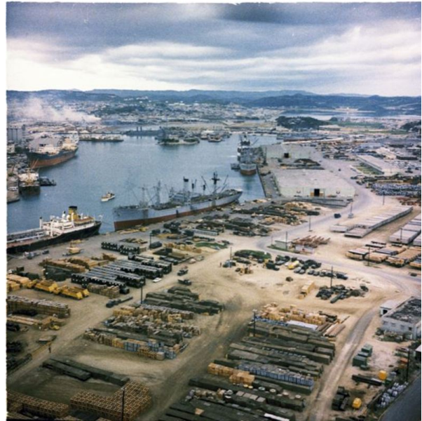
Naha Port was the main entry point for Agent Orange on Okinawa