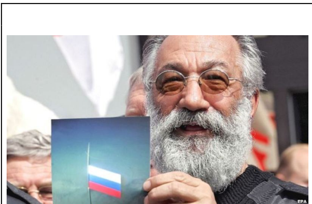
Artur Chilingarov, head of Russian expedition to the Arctic-2007, shows picture of Russian flag in the seabed below the North Pole in August 2007.

controlling the Northeast Passage to prevent foreign intervention, and defending the sea lane to East Asia (OPRF 2012). A statement of principles, approved by then Russian President Dmitry Medvedev in 2008, regards the Arctic as a strategic resource base of primary importance to Russia. Foreseeing the possible rise of tensions developing into military conflict, the document prescribes “building groupings of conventional forces in the Arctic zone capable of providing military security in different militarypolitical conditions” ( Rossiyskaya Gazeta 2009).