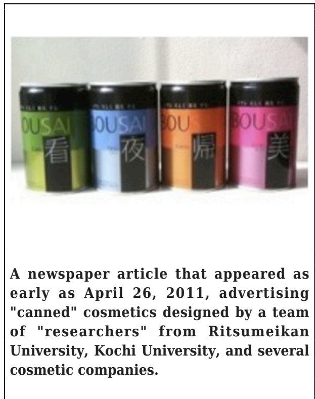
A newspaper article that appeared as early as April 26, 2011, advertising "canned" cosmetics designed by a team of "researchers" from Ritsumeikan University, Kochi University, and several cosmetic companies.