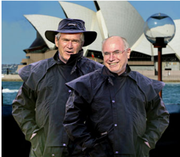
Australian Prime Minister John Howard with President George W. Bush. ( The Courier Mail , 31 January 2009)

Along with other US “client states,” Australia bears a responsibility, rarely acknowledged, for the often devastating consequences of diplomatic choices adopted out of the belief that, at all costs, the interests of their super-power ally had to be given priority.