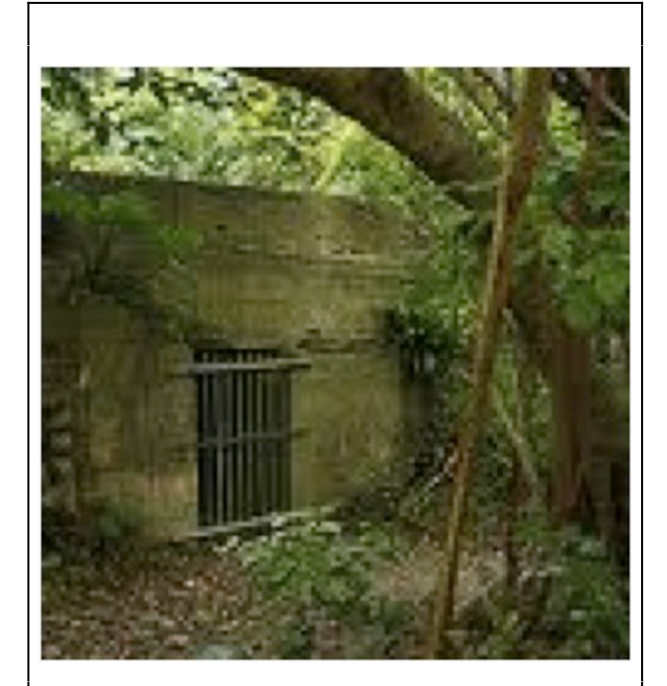
An entrance to 32<sup>nd</sup> Army HQs at Shuri Castle

authorities. When the Prefecture erected a historical marker at the site of the remains of the 32<sup>nd</sup> Army Headquarters Trenches, which served as the command post from which the Battle of Okinawa was coordinated and waged,<sup>4</sup> it committed the audacity of unilaterally eradicating any mention of 'comfort women' and 'the massacre of local civilians' from the explanatory text that the Prefecture had entrusted the 'Historical Marker Planning Committee' to write, executing this change without so much as a word to the committee itself. When this came to light, the two local newspapers reported on the story for many days on end, and the details of the Committee's deliberations on the proposed explanatory text were also subsequently made public; the Prefectural authorities in charge, however, show no indication of any willingness to reconsider their actions.