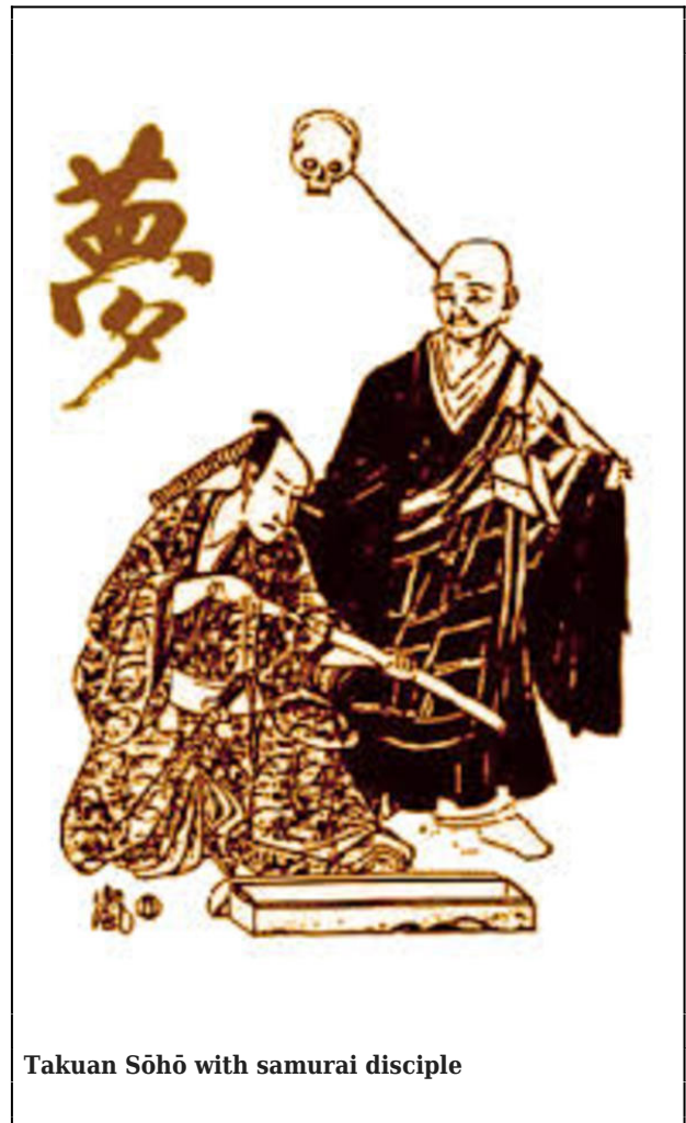
Takuan Sōhō with samurai disciple

Shōsan (1579-1655) who urged his disciples to develop a warrior's fortitude. Both of these latter Zen masters had earlier been samurai and entered the priesthood only after retirement, i.e., upon reaching an age when they were no longer fit for battle.