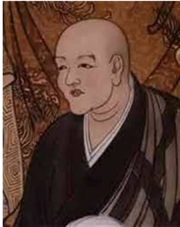
Zen Master Dōgen