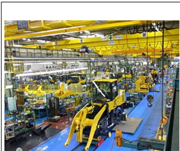
Komatsu assembly wing, Azawa

What is missing from the EY study, as well as from Japan's smart city effort as a whole, is benchmarking. The Abe cabinet should be doing this through the CIO office they set up to coordinate initiatives. The mind-numbing scale of our collective threat on resources as well as the scope of the business opportunity in smart cities suggest real leadership lies in taking up Koizumi's approach and - if not getting out of nuclear - at least getting on with the job of governing in the emerging smart cities sector. The vast welter of smart policies and projects in Japan needs a benchmark. One very instructive case might be the firm Komatsu, the world's second-largest producer of mining equipment. Komatsu's Awazu factory in Ishikawa Prefecture boasts a refurbished assembly wing whose power demand has been slashed a remarkable 92%. 39