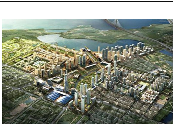
Songdo Smart City

On May 27 Ernst & Young Institute Japan (EY) released a Japanese-language study, summarizing Japan's over 200 smart city projects. EY's work is especially well timed. Among other recent developments, June 2 saw Apple join a long list of firms including Toyota Home 1 by entering the "smart home" market. 2 The global background includes thousands of smart-city projects, collectively worth at least USD 650 billion in 2014. 3 At over USD 40 billion, Korea's Songdo smart city project is the costliest private-sector real-estate development ever undertaken. 4