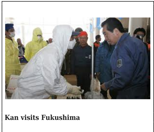
Kan visits Fukushima

Kan was a convenient lightning rod for this frustration, and because he stepped on powerful toes in the “nuclear village”, there was an orchestrated campaign to oust him. For example, twice TEPCO spread false information that was aimed at tarnishing Kan, only to recant. TEPCO claimed that Kan's visit to the stricken reactors on March 12 was the reason why venting did not proceed, thus causing the hydrogen explosions on March 12th, 13th and 15th.