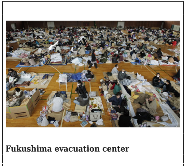
Fukushima evacuation center

confidence motion showed that a vast majority of Japanese did not think ousting Kan was a pressing priority even though he was unpopular. In the court of public opinion, the verdict on national politicians is dereliction of duty.