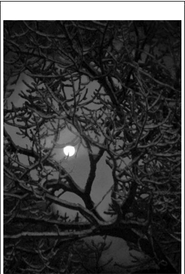
"Elf's Forest." Courtesy of Max Fujishima.