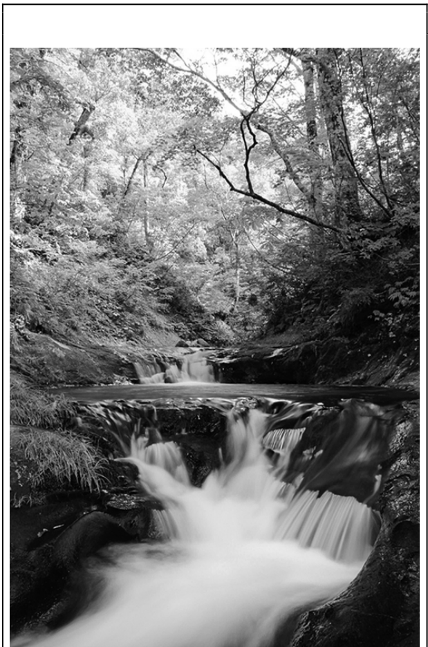
A beech forest in Tadami Town.

Abe Ryūsei, an elementary-school pupil, wrote this haiku in an impromptu haiku session with Mayuzumi. It reads like a natural, conversational utterance. But it fulfills the traditional haiku requirements of the set form of 5-7-5 syllables and the inclusion of a seasonal word.