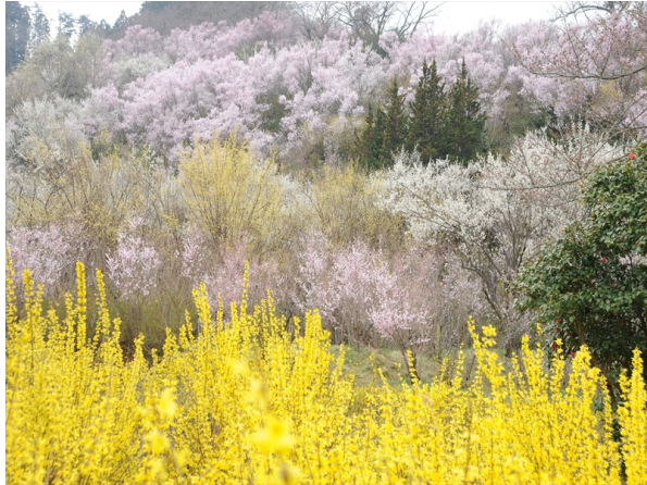
Viewing cherry blossoms.