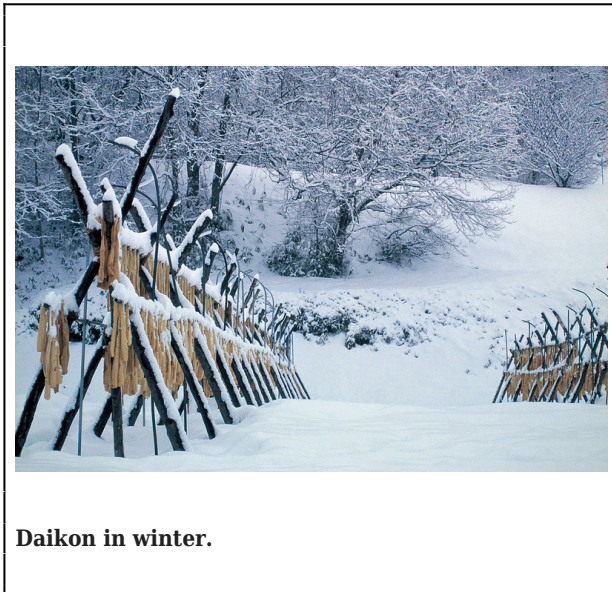
Daikon in winter.

Sendai was one of the cities hit hard by the earthquake and tsunami.