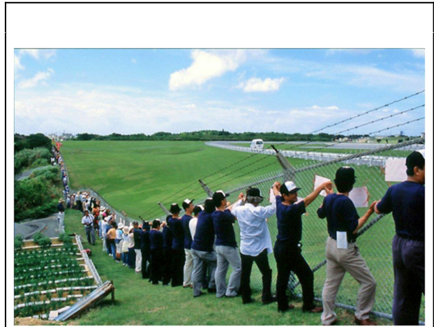
Protesters link hands encircling Futenma Base

in Okinawa. On this point, the Okinawan people across party lines are unified and have made plain in successive elections at every level and in repeated demonstrations of massive scale.