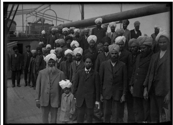
1. Gurdit Singh (front row, left with his son) challenged Canada's exclusion laws by chartering the Komagata Maru in Hong Kong and bringing 376 of his compatriots to Vancouver.

In January 1914, Gurdit Singh, a businessman based in Singapore visited Hong Kong where he found many of his countrymen destitute and stranded because racially motivated immigration restrictions prevented them from going to Canada or the US. He resolved to break the immigration colour bar and chartered the Japanese steamship Komagata Maru to go to Canada in the hope of establishing a business-venture taking passengers from India to Canada.