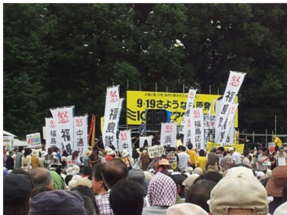
Good-bye Gempatsu Demo.

Indignez-vous! Get angry, resist and fight against the blatant social injustices in our world! Thus Stéphane Hessel, the 93-year old French former Resistance fighter, called on the youth in France, and everywhere else, in his inspirational pamphlet published in France in 2010. It has since been translated into dozens of languages, though not yet into Japanese. 2 Indignation, for Hessel, provided the fundamental motivation for the Resistance movement in Nazi-occupied France, and he finds plenty of reasons for outrage today.