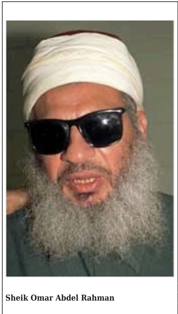
Sheik Omar Abdel Rahman