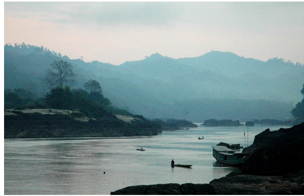
Site of the proposed Xayaburi Dam

A telling case is underway whose outcome will demonstrate whether or not the cooperative arrangement represented by MRC will take note of the SEA as the most comprehensive scientific assessment to date. The first of the mainstream dams, Xayabouri, was notified by Lao PDR for prior consultation by MRC member states over a six month period to April 2011. This is the first time that other MRC countries have been asked to give their opinions on a dam proposed in the territory of one of their neighbours. Xayabouri is a Thai project inside Laos, whose lead contractor is the Thai company Ch. Kanchang, whose financing would be mainly by Thai banks, and whose market for power is primarily in Thailand. On 19 April, the Joint Committee of MRC held a special meeting to decide what position to take on the dam. The outcome of the meeting was that the countries agreed to disagree , based on concerns expressed both in technical reviews of the dam proposals and a series of public consultations, at which strong opposition to Xayabouri and other mainstream dams was expressed. The matter was referred upward to the Ministerial Council level, effectively putting the dam in abeyance.