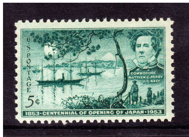
Commodore Perry Commemorative Stamp 30

In 1953, the U.S. Post Office issued a stamp commemorating the hundredth anniversary of the opening of Japan by Perry in 1853. The timing of this stamp is significant also for being released just a year after the end of the 1945-1952 Occupation of Japan. The design of the stamp incorporated the anchorage of American warships in Tokyo Bay and a portrait of Perry, with Fuji in the center and a samurai in the lower right.