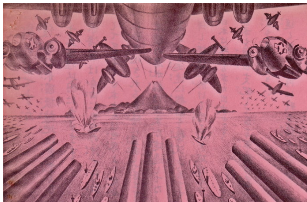
Bombardment of Fuji 21

The sacred mountain was actually “targeted” by another American leaflet. Late in the war, when American planes were regularly bombing Japan, the “psywarriors” printed and dropped single sheets with the triangular peak prominent in the center, like a bull’s-eye. The lower third of the picture is a formation of battleship guns and ships pointing at Fuji; the upper third of the leaflet is the underside of a large four-engine bomber, flanked by a number of twin-engine bombers all headed toward Fuji, with two bombers returning from their sortie. Here the mountain is a visual rubric for Japan, the recipient of unrelenting air and naval bombardment, intended to invoke fear, despair, and surrender.