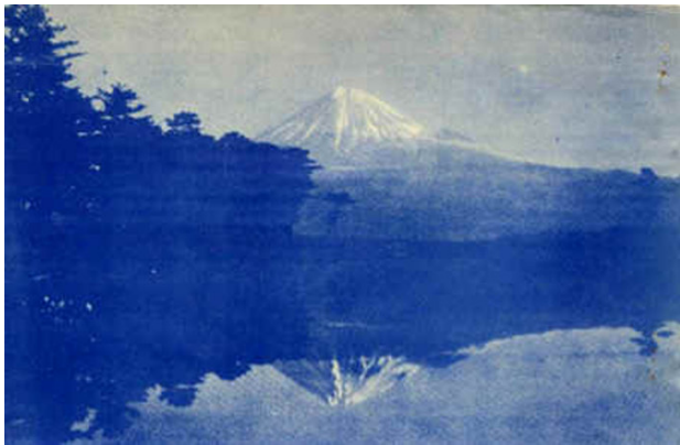
Mirror Image of Fuji 15

But you are here on a miserable island, awaiting our overwhelming force of men and machines. Your military leaders grow fat at home as they continue to mislead your people. They enjoy the beauties of the season and the thrilling sight of Mount Fuji. Their children eat with them and bask in their love. 17