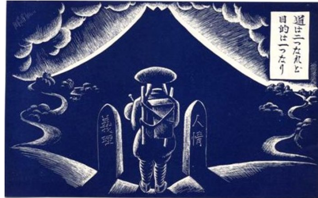
Fuji Pilgrim 20

A leaflet in the style of a traditional print, a rather sentimental landscape, is leaflet 520. The picture features a stereotypical arrangement of rock, beach, waves, ocean, and two curved pines framing a distant Fuji. The text on the back of the leaflet, although not explicitly mentioning Fuji, parlays emotional attachment to the peak to criticize the military leadership and encourage soldiers to return to their homeland.