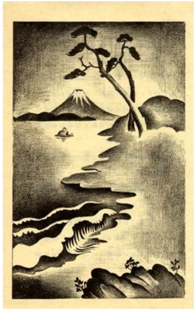
Traditional Print 18

Now is the season of beauty in your homeland and the glorious snow-capped peak of Mount Fuji beckons to the traveler and the visitor. Your parents and wives await you and your dear children